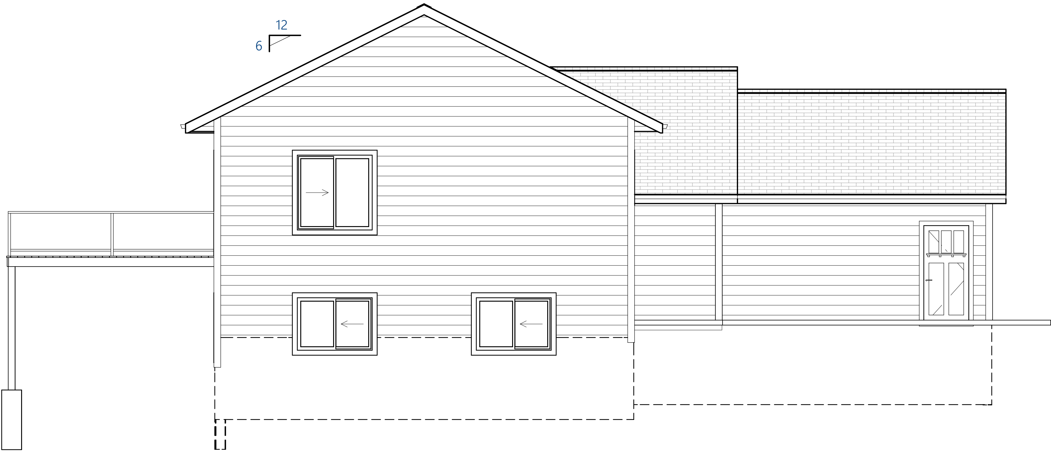
2 A2.1 LEFT ELEVATION SCALE: 1/4" = 1'-0"

NOTE: TO THE BEST OF OUR KNOWLEDGE, THESE PLANS ARE DRAWN TO COMPLY WITH OWNER'S AND/OR BUILDER'S SPECIFICATIONS AS WELL AS BUILDING CODE AND ANY CHANGES MADE ON THEM AFTER PRINTS ARE MADE WILL BE DONE AT THE OWNER'S AND / OR BUILDER'S EXPENSE AND RESPONSIBILITY. THE CONTRACTOR SHALL VERIFY ALL DIMENSIONS AND ENCLOSED DRAWING. GRIZZLY TRUSS IS NOT LIABLE FOR ERRORS ONCE CONSTRUCTION HAS BEGUN. WHILE EVERY EFFORT HAS BEEN MADE IN THE PREPARATION OF THIS PLAN TO AVOID MISTAKES, GRIZZLY TRUSS CAN NOT GUARANTEE AGAINST HUMAN ERROR. THE CONTRACTOR OF THE JOB MUST CHECK ALL DIMENSIONS AND OTHER DETAILS PRIOR TO CONSTRUCTION AND BE SOLELY RESPONSIBLE THEREAFTER.