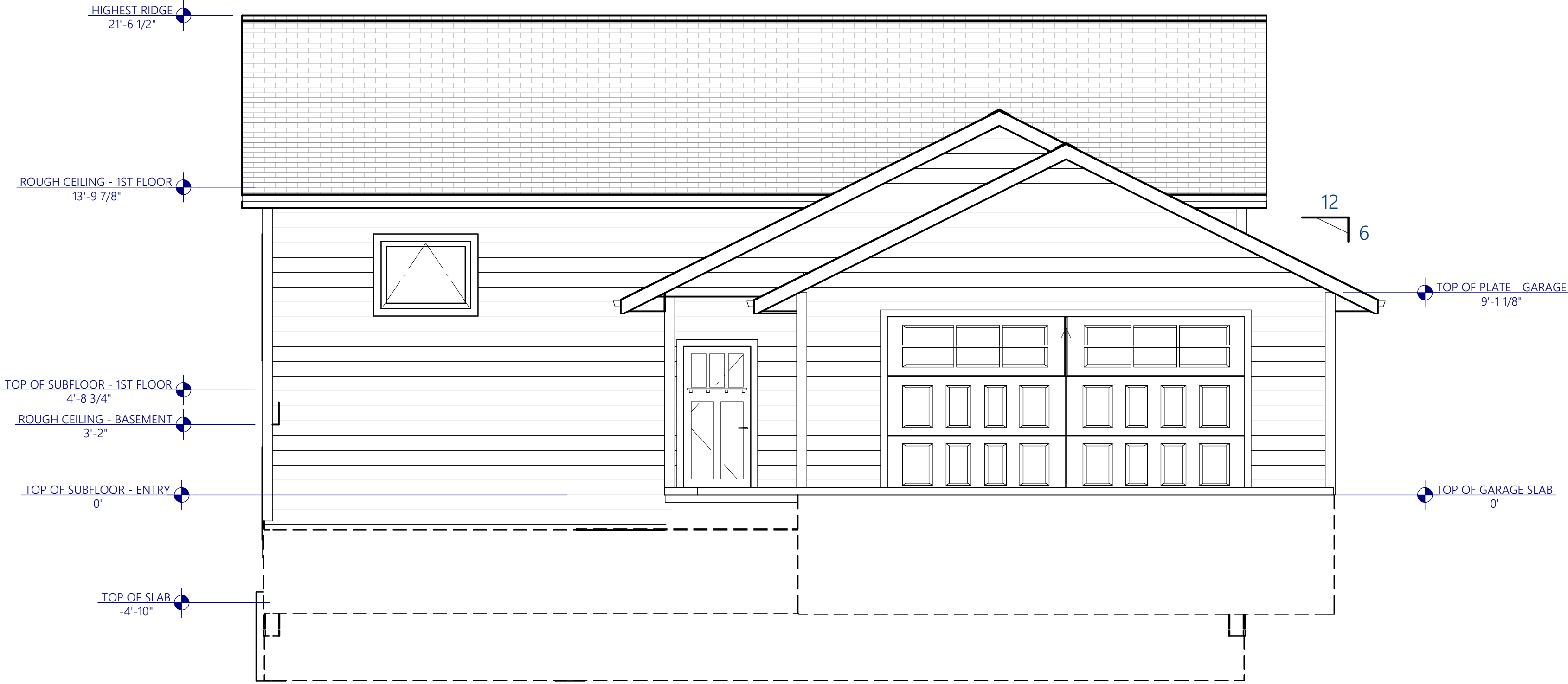
1 A2.1 FRONT ELEVATION SCALE: 1/4" = 1'-0"

NOTE: GC TO CONFIRM & VERIFY NEW FOUNDATIONS WITH OWNER, FOUNDATION CONTRACTOR, AND ON-SITE CONDITIONS