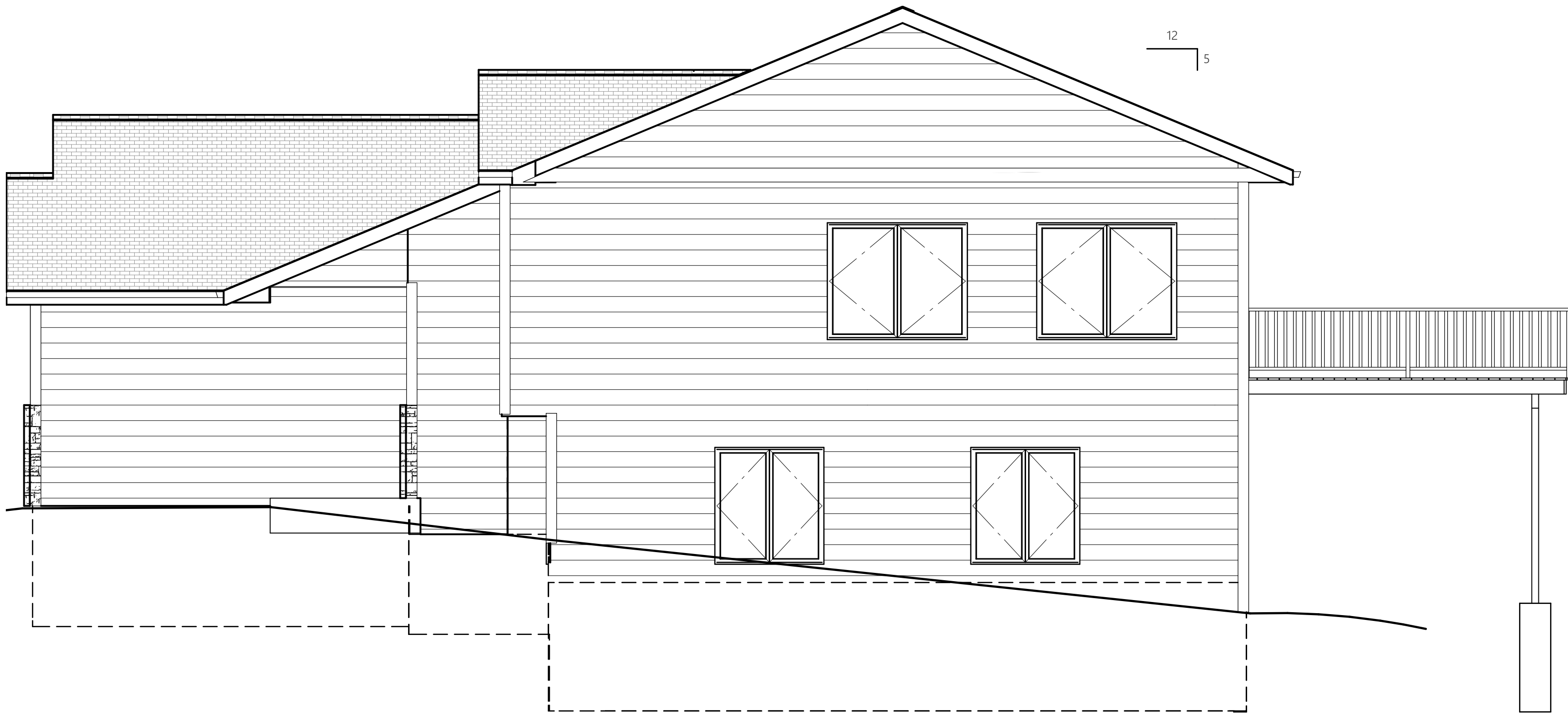
2 A2.2 RIGHT ELEVATION SCALE: 1/4" = 1'-0"

NOTE: ALL CONSTRUCTION MATERIALS, FRAMING MEMBER SIZES, AND OTHER BUILDING COMPONENTS DETAILED HEREIN ARE BASED ON DESIGN CONCEPTS. THE GENERAL CONTRACTOR AND/OR OWNER SHALL VERIFY ALL MATERIALS, SIZES, AND METHODS TO BE USED FOR CONSTRUCTION PRIOR TO COMPLETING ANY WORK. UPON BEGINNING WORK, THE GENERAL CONTRACTOR ASSUMES ALL LIABILITY FOR CONSTRUCTION MATERIALS, FRAMING MEMBERS, BUILDING COMPONENTS, AND METHODS USED, INCLUDING BUT NOT LIMITED TO COMPLIANCE WITH NATIONAL, STATE, AND LOCAL BUILDING CODES AND REGULATIONS.