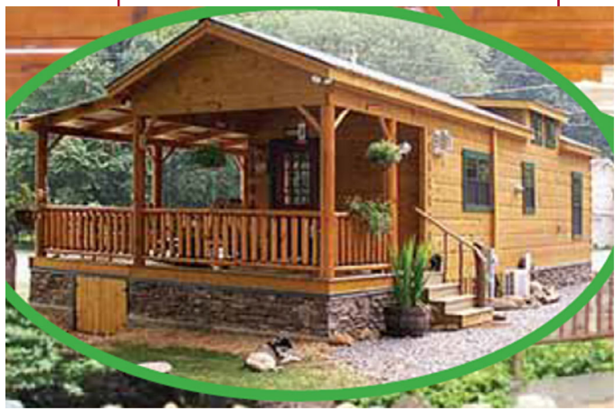
ABOVE: This is a model of the 10 cabins to be built at Mile Creek County Park in Pickens County.

On the environmental front, Duke is adusting operations to stabilize lake