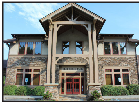
Commercial design standards can encourage construction of attractive buildings like this Blue Ridge Bank branch in Bountyland.

provide adequate off-street parking for customers, employees, and deliveries to avoid blocked roads and congestion. The design ordinance is now at the Planning Commission. A public hearing is tentatively set for Mar. 1. Strong public support is key to its future. Please consider attending this hearing or emailing supportive comments.