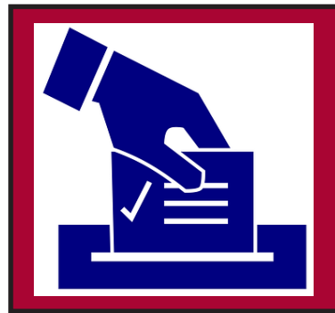
Before you vote, learn Council candidates' positions on land planning & lake protection issues.

If an individual elects not to take part and provide answers, his or her lack of response will be reported when we send the questionnaire summaries.