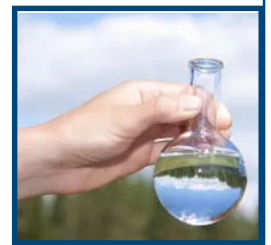
A recent AQD Blog details how the Oconee County Lake Overlay protects our

◆ More—Has many offerings ranging from AQD Bylaws to upcoming events.