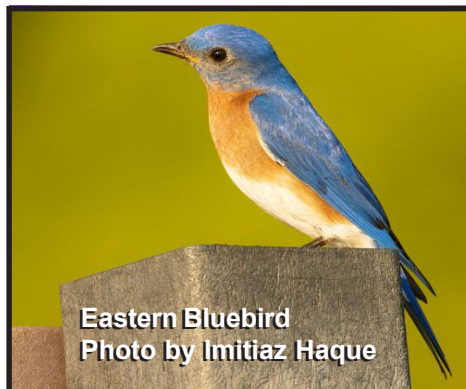
Eastern Bluebird

Following Duke Energy's 2017 lump sum contribution of $1 million to the HEP program, continued funding relies on Duke's collection of $500 lake use permit fees—a funding source expected to yield $75,000 to $100,000 annually. While the committee expressed some concern about