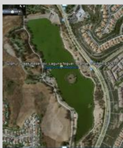
Figure 1. Aerial view of Laguna Niguel Lake (2009)

Laguna Niguel Lake (Sulfur Creek Reservoir) (Figure 1) was built in 1966. The lake is primarily used for scenic recreation and local fishing, however it also is an important sanctuary for waterfowl. Recent issues with poor water quality, foul odours, declining fishery and outbreaks of avian botulism prompted the need for water quality management. Although the nutrient inputs from the inlet creek and surface runoff contribute to the annual load of phosphorus into the lake, monitoring of the water quality and lake sediments in recent years suggested internal phosphorus loading as a significant contributor to the water quality issues.