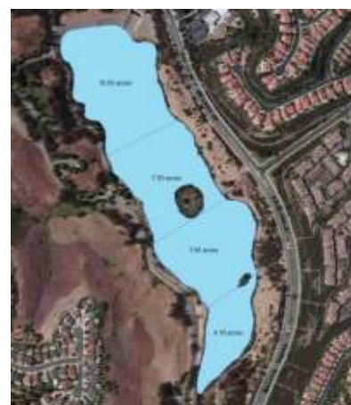
Figures 2 & 3. Phoslock application to 4 established zones of Laguna Niguel Lake.