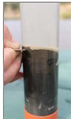
Figure 4. Sediment cored sample collected after Phoslock application to Laguna Niguel Lake.

Sediment samples were collected from 3 sites in the lake using a threaded stainless steel coring apparatus. Sediment samples were taken prior to the Phoslock application (4/29/2013); and 3 and 6 months post-treatment (8/7/2013; 12/4/2013) (Figure 4). The top 5cm layer of sediments (2 samples homogenized composite) from each sample location were sent to the lab for analysis. Sequential extraction was used to determine relevant phosphorus fractions and compare concentrations of available and stable phosphorus forms prior to and following the treatment.