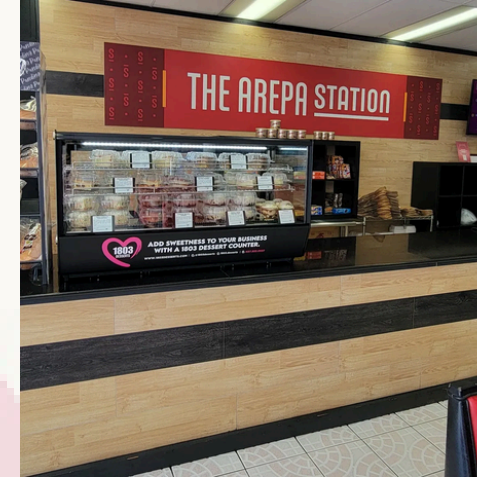
8101 Narcoossee Rd, Orlando, Fl 32822 (Inside) The Arepa Station