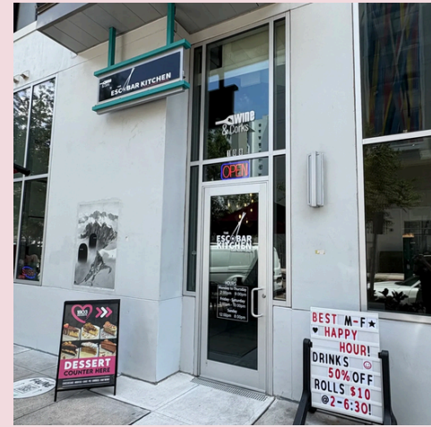
420 E Church st Orlando fl 32801 Suite 108 (Inside) The Escobar Kitchen