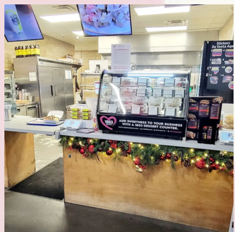
11787 International Dr. Suite 118, Orlando, Fl 32821 (Inside) El Genio del Shawarma