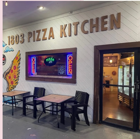
1803 E Winter Park Rd, Orlando Fl 32803 (Inside) 1803 Pizza Kitchen