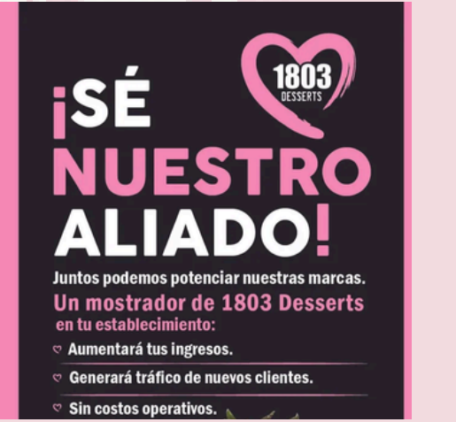
Esperamos por ti!