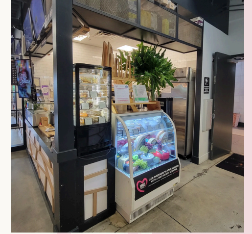
3801 Avalon Park E Blvd, Orlando Fl, 32828 (Inside) Cheese to Share