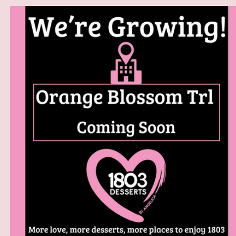
12531 S Orange Blossom Trl, Orlando Fl 32837 (Inside) Pepitos Guaro