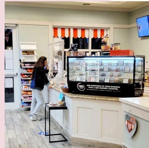
8510 Insular Lane, Orlando Florida, 32827 (Inside) Lake Nona Deli & Market