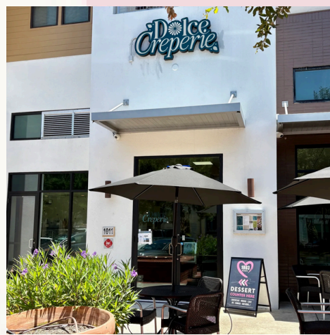
945 City Plaza Way Ste 1011 Oviedo Fl 32765 (Inside) Dolce Creperie