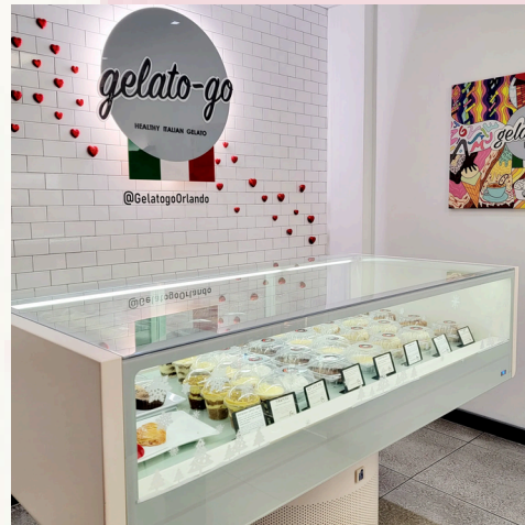
513 South Park Avenue, Winter Park, Florida 32789 (Inside) Gelato Go