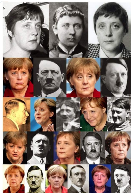
Angela Merkel, 20. 4. 1954, Nemčija

https://pbs.twimg.com/media/DX9XOEHW4AAKFSC.jpg