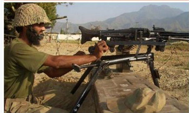
A Pakistan soldier mans a machine gun in the north-western Bajur region in Pakistan.

The Obama administration has announced it will withhold more than one-third of all military assistance to Pakistan - an aid envelope worth some $800m (£498m). The withheld aid includes funding for military equipment and reimbursements for selected Pakistani security expenditures - including a payment of $300m for counterinsurgency programmes.