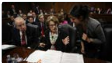
Bill To Protect Mueller Investigation Approved By Senate Judiciary Committee