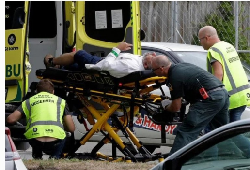
Ambulance staff take a man from outside a mosque in central Christchurch, New Zealand, Friday, March 15, 2019.

I cover crime, privacy and security in digital and physical forms.