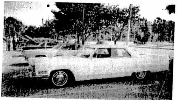
Picture from the Oct 4th meet showing Class 1 (background) to Class 3.