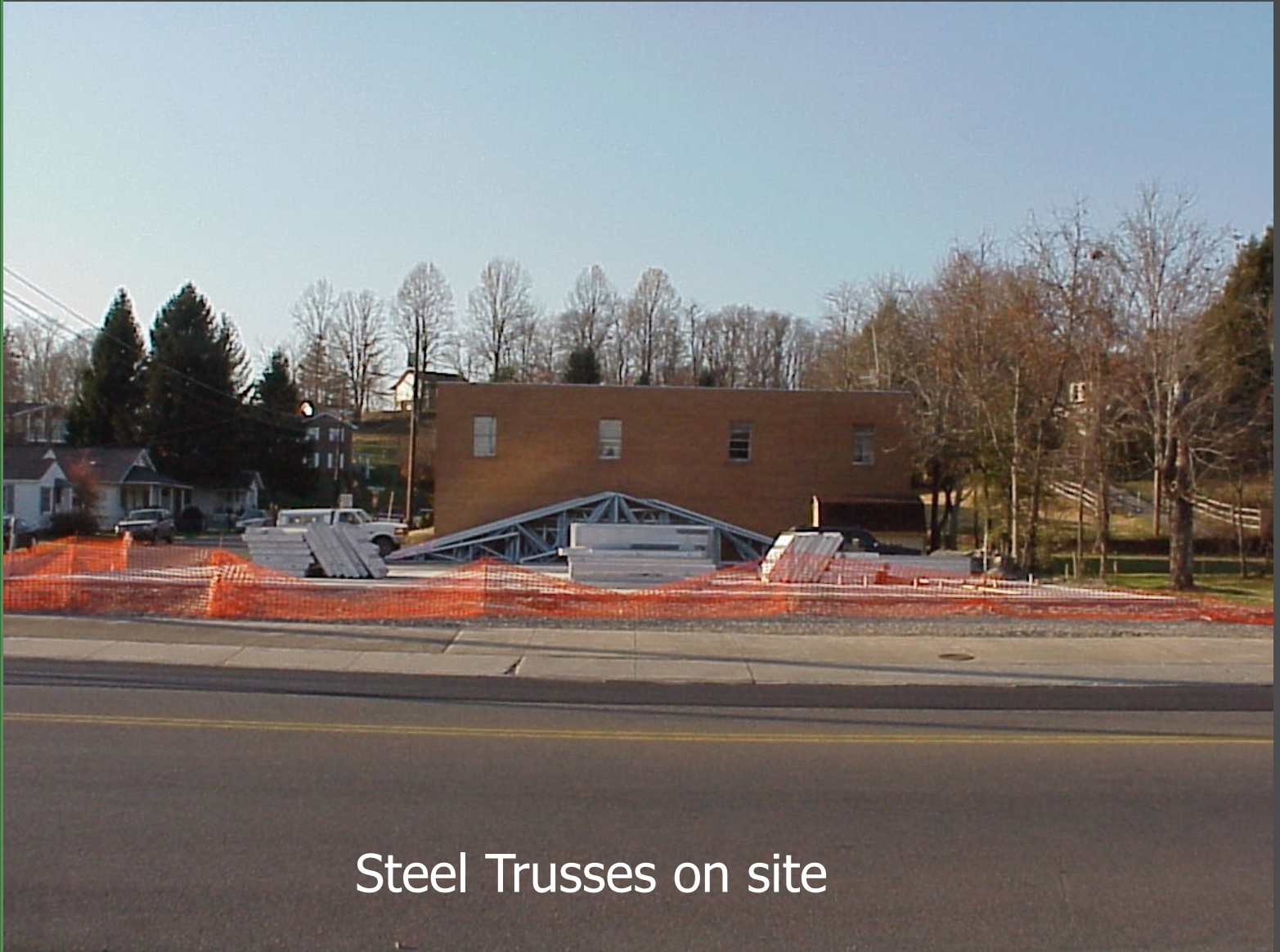
Steel Trusses on site