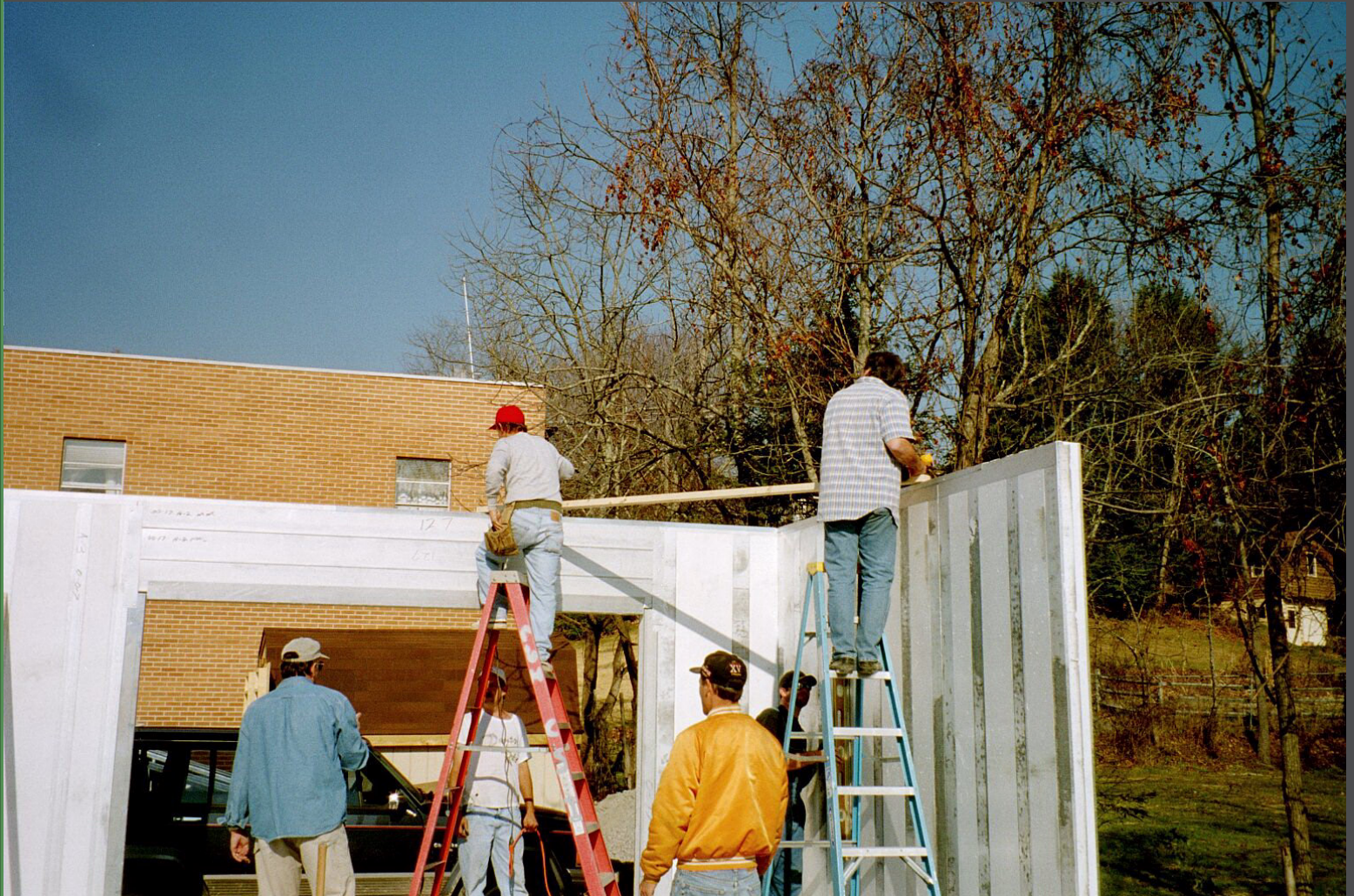
Diagonal Brace @ corner