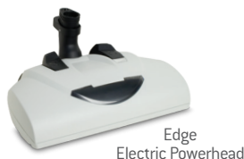
Edge Electric Powerhead