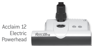
Acclaim 12 Electric Powerhead