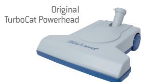
Original TurboCat Powerhead