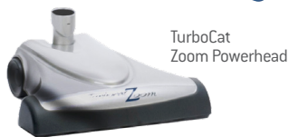
TurboCat Zoom Powerhead