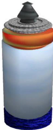
Figure 1. Product Design of real pen design using AIDesign software. The software is accessed under payment fee from https://aidesign.today

Fig. 1. shows blue color ink of pen bowl at the bottom, with the pen material on top as a cylindrical tube made of solid ice ( -10^{\circ}\text{C} ) and heated by top with a small pen bowl with R-134a, with a top