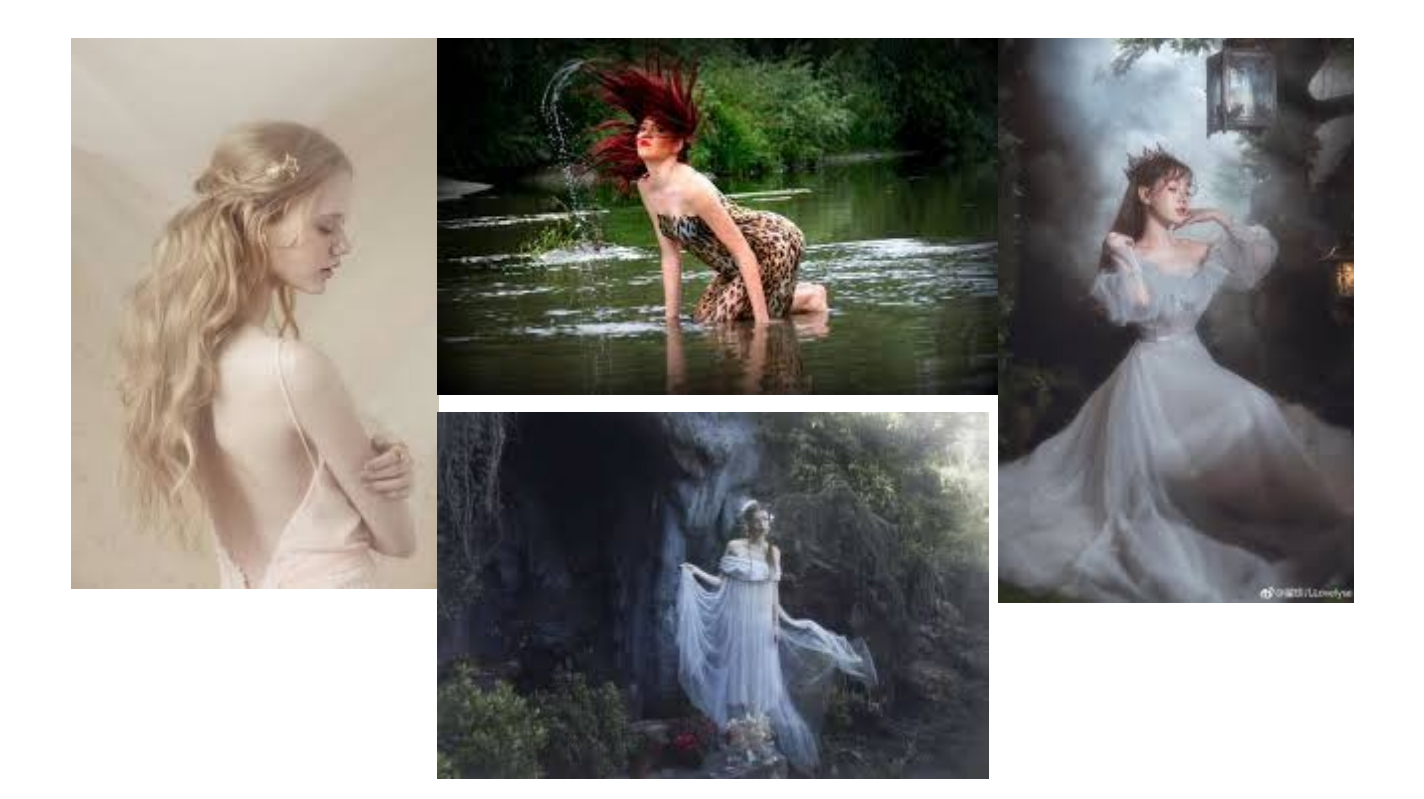
Figure (5.2) High resolution HD camera and IPhone HD camera .jpeg generated real human images saved as .jpeg format