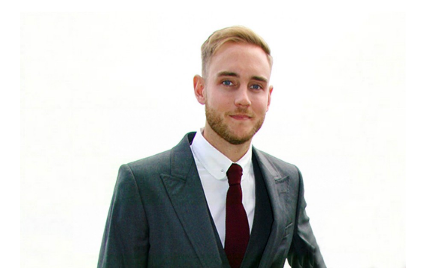
Figure (7.2) High resolution HD camera and IPhone HD camera .jpeg generated real human images saved as .jpeg format