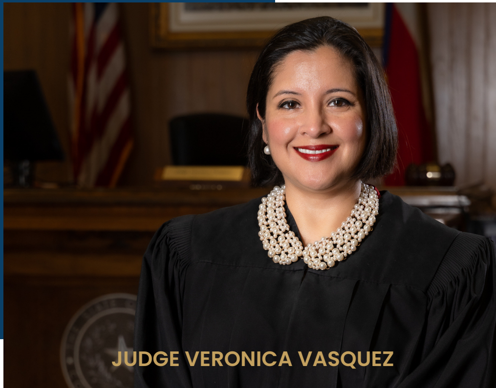
JUDGE VERONICA VASQUEZ