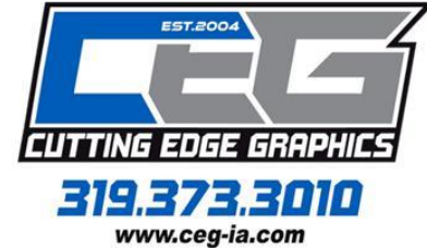
Automotive graphics and wrap