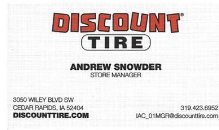
Tires and wheels