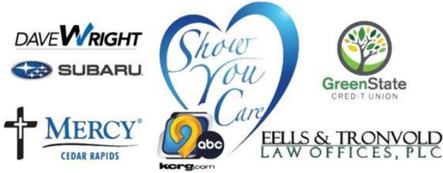
Supporters of the CRCC Car Show