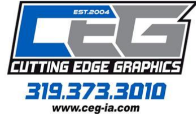
Automotive graphics and wrap