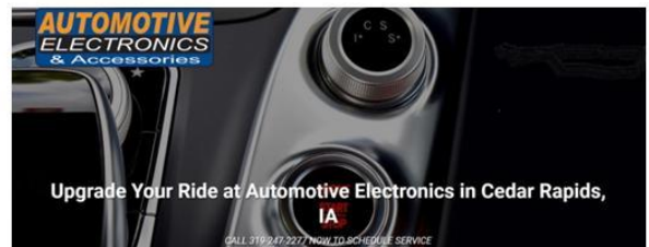
Automotive electronics and sound systems