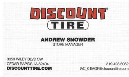
Tires and wheels