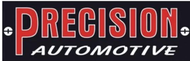
Automotive repairs and custom work