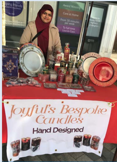
An Elthorne Pride resident who has been taking part in our Enterprise initiatives.