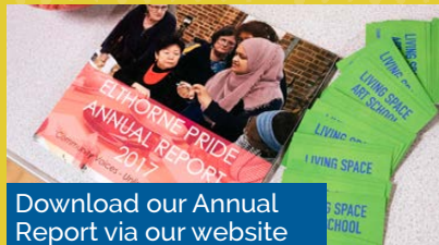
Download our Annual Report via our website