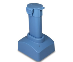
Battery Recharging Station

A/C Power Adapter - The 115/230 A/C power adapter allows for continuous operation. Included with certain models or may be ordered separately.