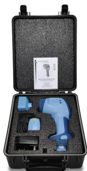
Deluxe Kit Case