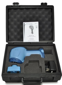
Standard Kit Case