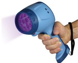
We also offer a Nova-Pro Ultra Violet LED Invisible UV Light Inspection Instrument