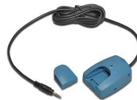
Remote Laser Dock