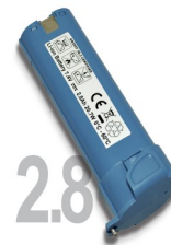
Rechargeable Li-ion Battery