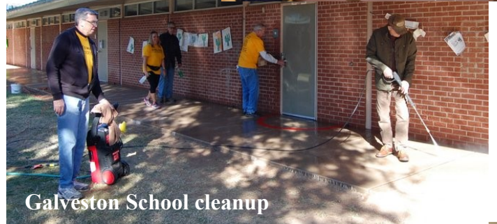
Galveston School cleanup