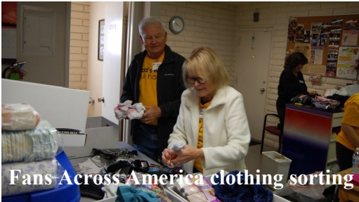
Fans Across America clothing sorting