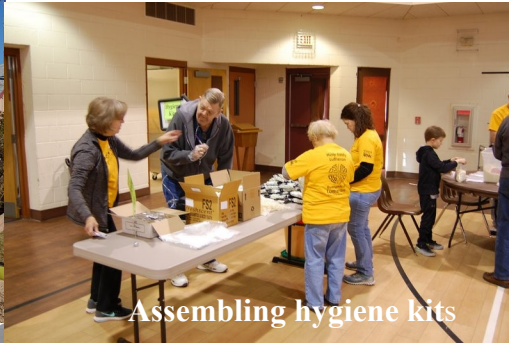
Assembling hygiene kits