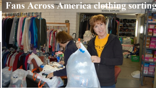
Fans Across America clothing sorting