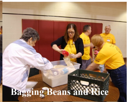
Bagging Beans and Rice