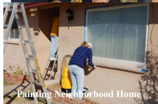
Painting Neighborhood Home