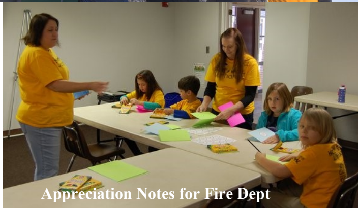
Appreciation Notes for Fire Dept