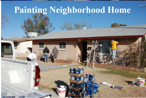
Painting Neighborhood Home