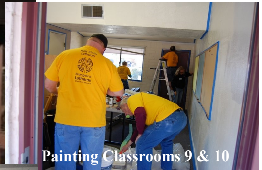
Painting Classrooms 9 & 10