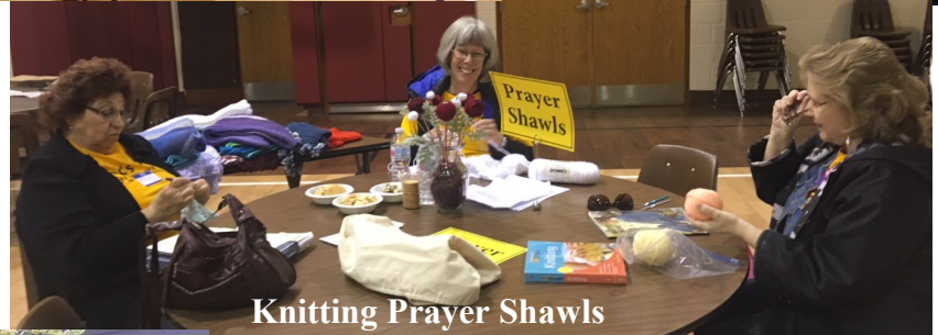
Knitting Prayer Shawls