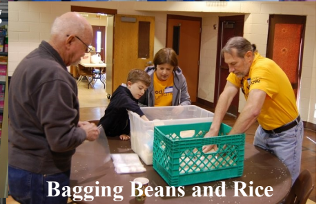
Bagging Beans and Rice