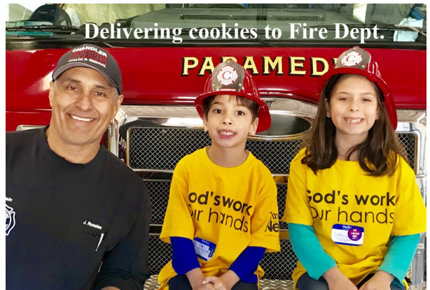
Delivering cookies to Fire Dept.