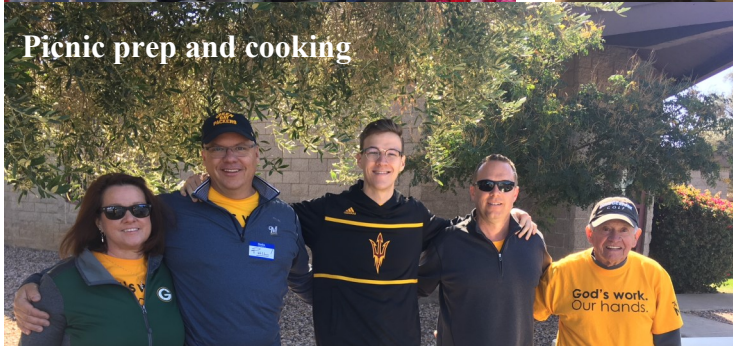
Picnic prep and cooking