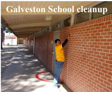
Galveston School cleanup