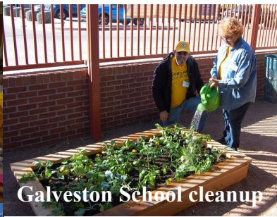
Galveston School cleanup