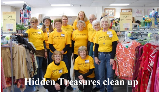
Hidden Treasures clean up