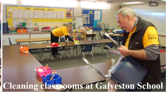
Cleaning classrooms at Galveston School