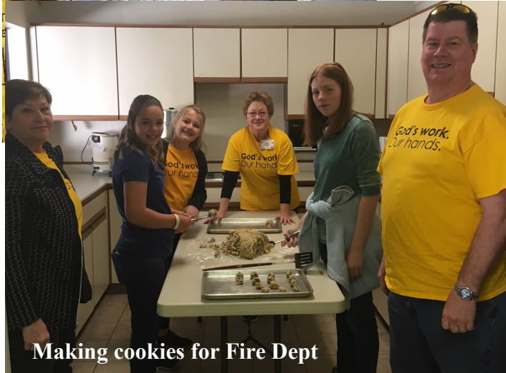
Making cookies for Fire Dept