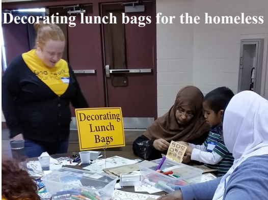
Decorating lunch bags for the homeless