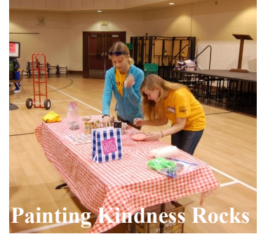
Painting Kindness Rocks