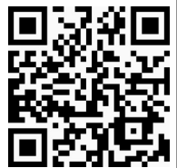
Give to YT2024

Board members of Eagle Empowerment. Inc. started the year with excitement and enthusiasm. The first quarterly board meeting of 2024 ignited an infusion of energy. Board members traveling as chaperones with students during Youth Tour 2024 are thrilled to be collaborating with each other in finding creative ways to participate in fundraisers for the tour. The board is partnering with organizations committed to empowering youth. Members are looking forward to strengthening its connection with Goalsetter, Inc., mentoring students and enhancing our Financial Literacy Academy. The Parent Advisory Council, through the Family & Community Engagement Task Group, is a valuable resource to the board. Each parent is committed to support students as they participate in EE’s programs and services.