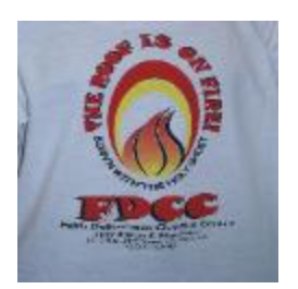
T-shirt worn by conference participants.