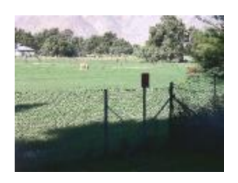
Scene of our first rest stop