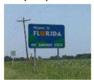
Welcome to Florida