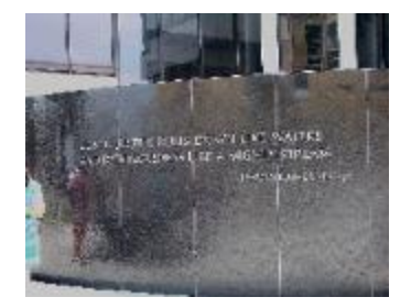
The Civil Rights Monument