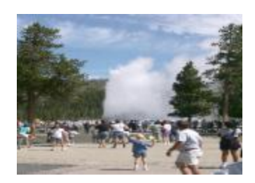
Eruption of "Old Faithful"