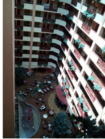
A Bird's Eye of the Hotel Lobby