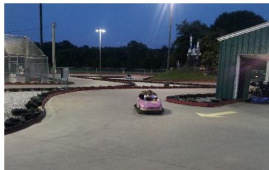
Me on The Go-Kart Track