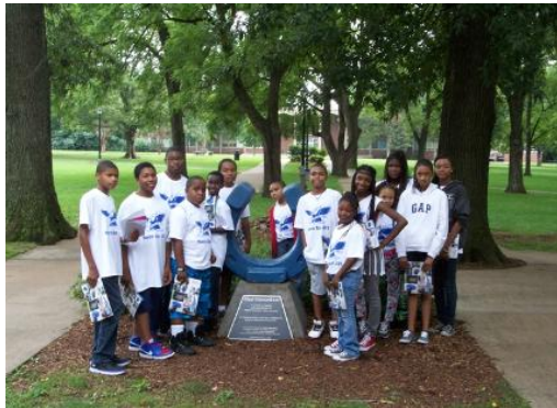
Team Grouped Around MTSU Horseshoe

When we left the medical college, we took a tour a of Fisk University. Fisk University had a lot to offer to students. A student can earn two degrees in five years with certain programs. Many famous figures have visited, attended, or