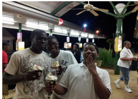
Some of the team with their after movie dessert