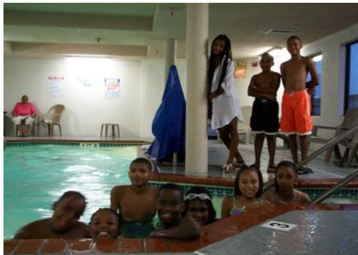
Having Some Fun At the Pool