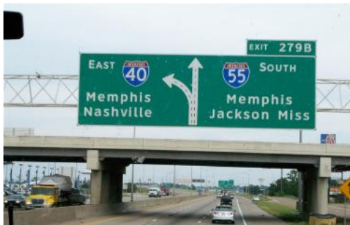
Junction to the Hotel