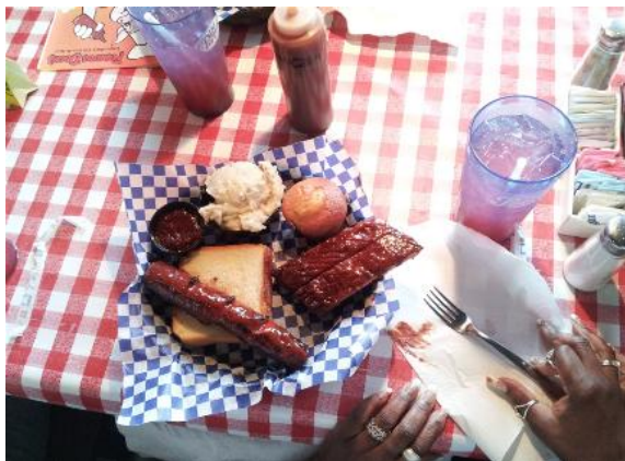
Fabulous Lunch Combo