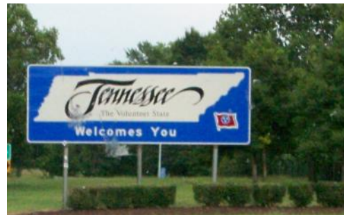
A Warm Welcome to Tennessee