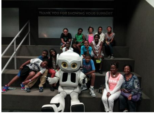
The Team with the Museum Mascot