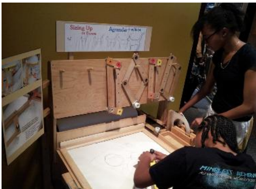
Me and My Sister Drawing on Another Station