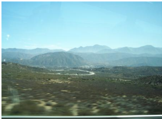
The landscape as we left Victorville