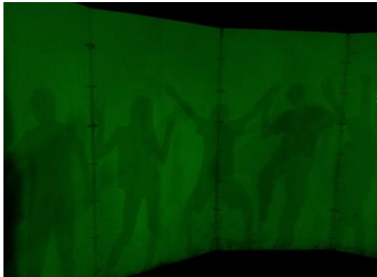
Picture of Our Shadows