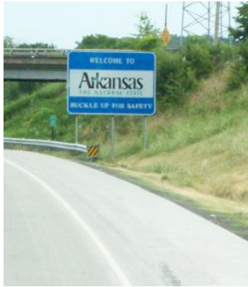
Welcome To Arkansas