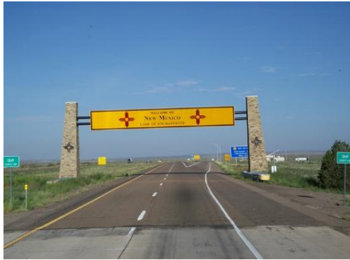
Entering Into New Mexico; The Land of Enchantment