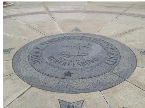
Crest at MTSU