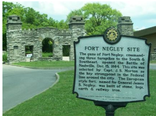
One of the Historic Markers Found Throughout Nashville