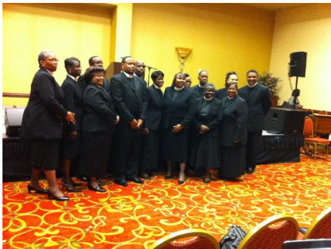
The Pastors of the Faith Fellowship