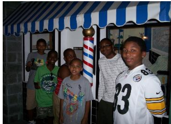
Me and My Friends in The Powerhouse Museum