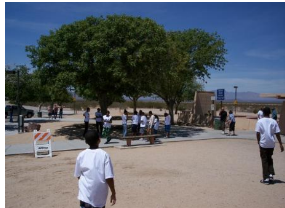
Our group at the Rest Stop