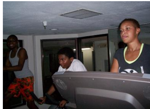
Strong Warriors in Training