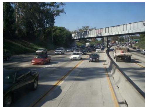
Los Angeles Traffic