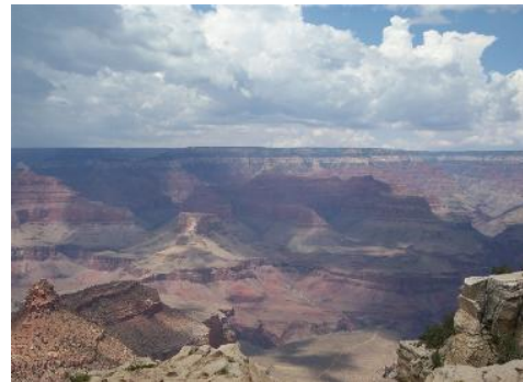
Another View of Grand Canyon