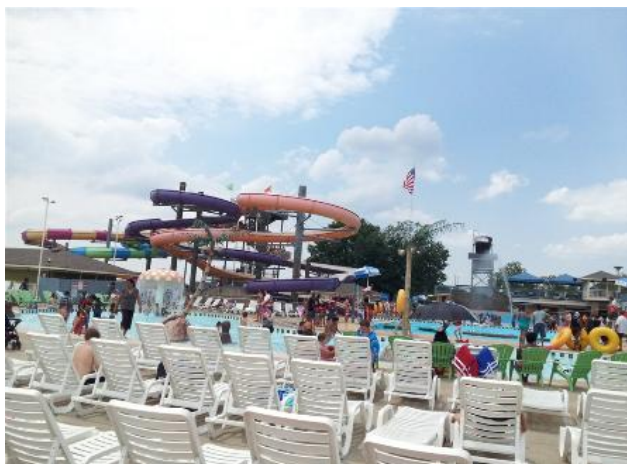
One View of Memphis Shores