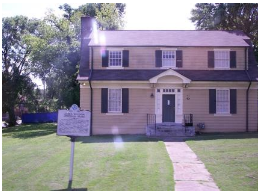
The House Where "Lift Every Voice And Sing" Was Written