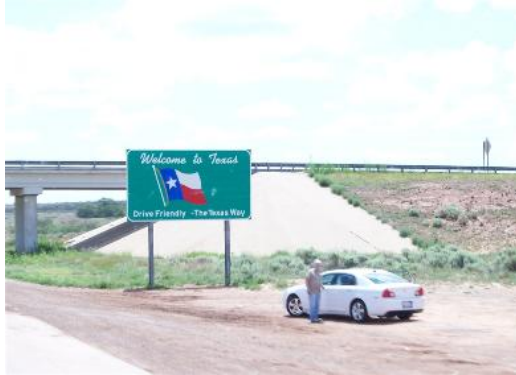
Welcome To Texas