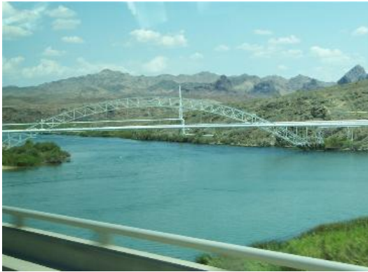
A view of the Colorado River