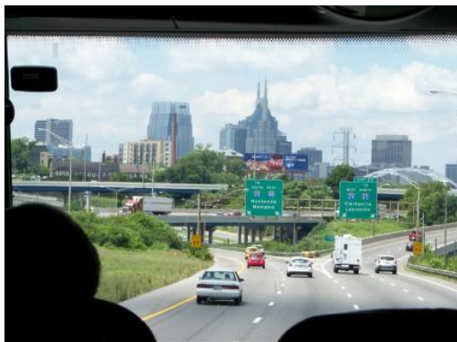
Skyline Entering Nashville