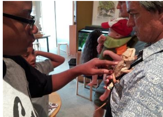
Friendly Wildlife in the Explora Center