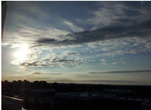
Sunrise in Murfreesboro, Tennessee

We made it into Little Rock, Arkansas. We found a Famous Dave's BBQ Restaurant along the way. We chose to eat there for lunch. We left the restaurant at 4:13pm. We unloaded our baggage at our hotel before heading to Regal Cinemas for a movie night. One part of the team went to see "Turbo." Another part of the team went to see "Fruitville Station." I was one of the ones who saw the movie "Turbo." I think it was pretty good. After the movies, we stopped at Sonic's Drive In restaurant for ice cream sundays.