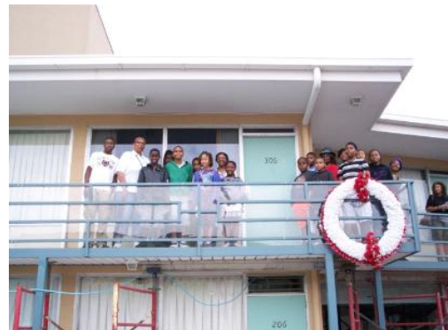
The Youth Tour team in Front of Apartment 306