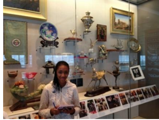
Standing Next to A few Presidential Gifts