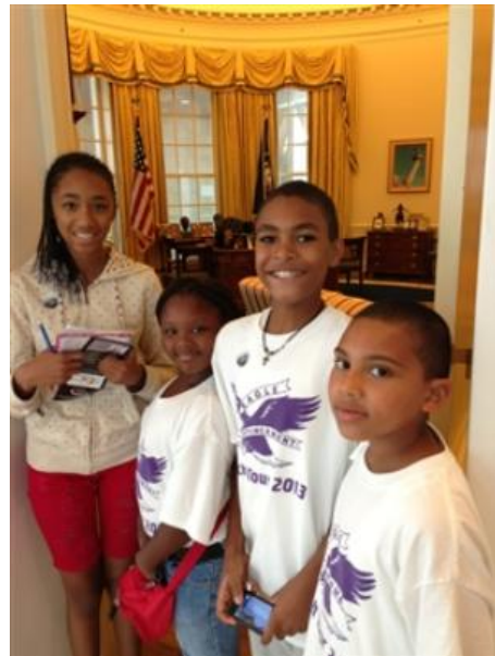
In front of Central High School in Little Rock, Arkansas Me and my Friends in front of the Oval Office