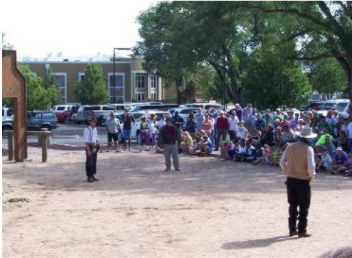
At the Western Stunt Show

We were truly amazed when we saw the Grand Canyon. Everyone took lots of pictures and had a great time. After the last stop of our tour, we went to lunch at "The Fountain". Most of us ate hot dogs, the rest of us ate sandwiches. We all drank soft drinks.