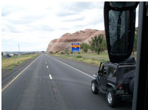
Driving Into Arizona State