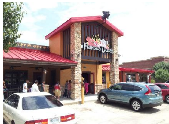
Lunch of the Day