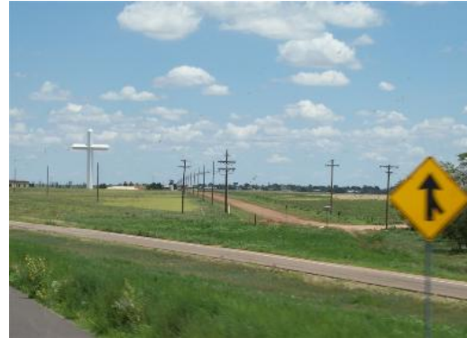
Giant Cross in the Distance