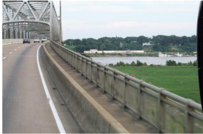
Bridge Crossing the Mississippi River