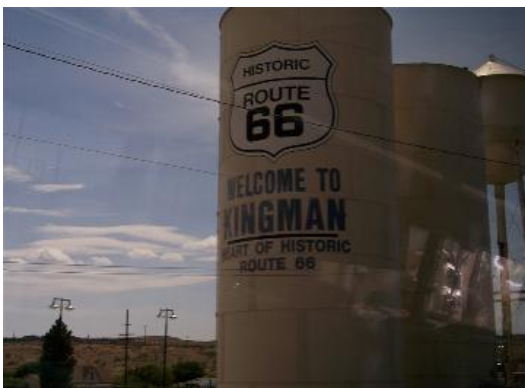
Welcome Silo on Route 66