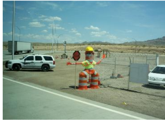
A Unique Friend at The Weigh Station