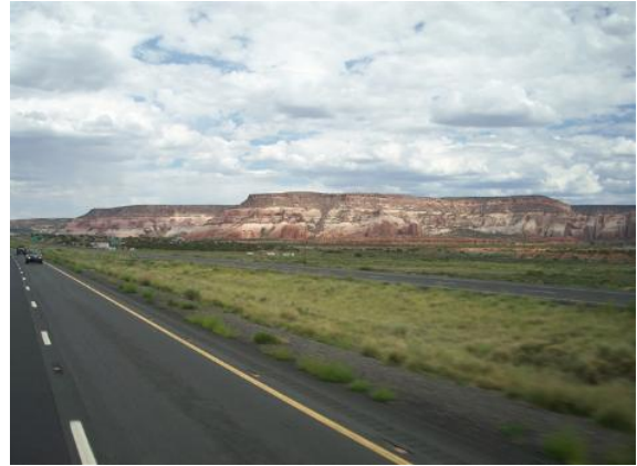
Rock Formations in New Mexico