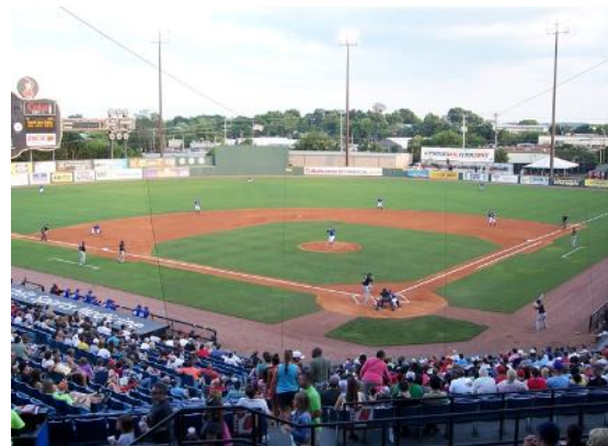
Baseball Field of the Nashville Sounds