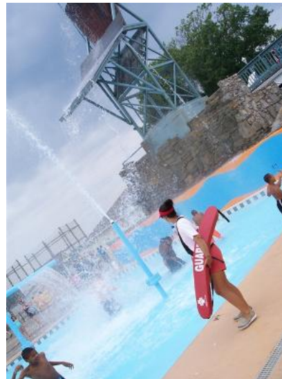
Young Men Experiencing the "Big Splash"