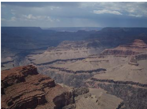
View of Grand Canyon