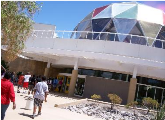
Entrance At the Explora Center