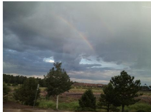
A little Rainbow by Route 66