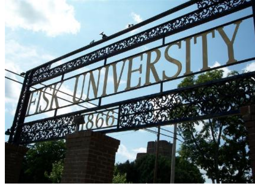
Entering into Fisk University