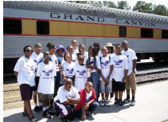
Team in Front of Train Car