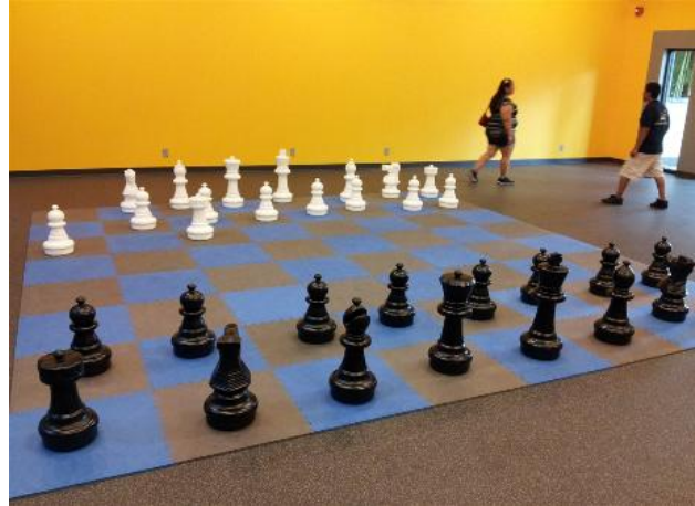
Life-Sized Chess Board