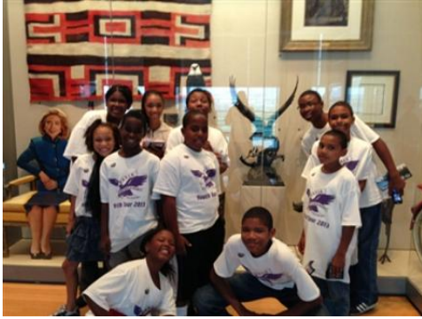
Standing around Bill Clinton's Eagle Statue