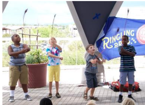
Learning Balancing in the Special Presentation