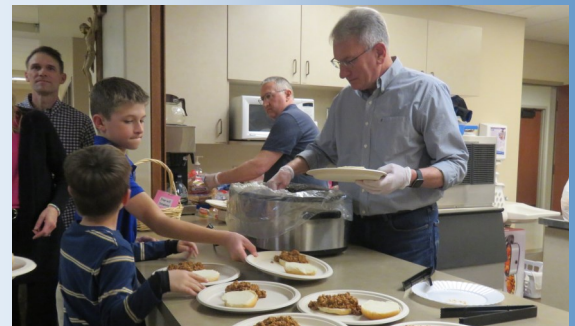
The Social Committee served a Sloppy Joe meal following 5:00 Mass this spring.