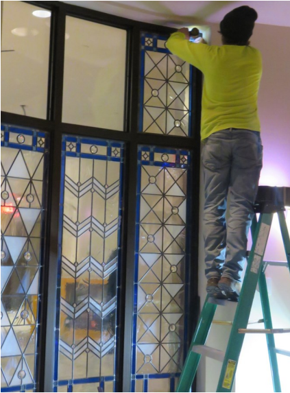
Installation of the new stained glass by the baptismal font, thanks to several generous donors.

The end is on the horizon! Soon, MCL will complete the few things left on their list for the Phase II addition. There will be a chandelier installed in the narthex (gathering space), the parking lot will be striped, the sprinkler system will be in place, and the sod will cover the bare ground near the church.