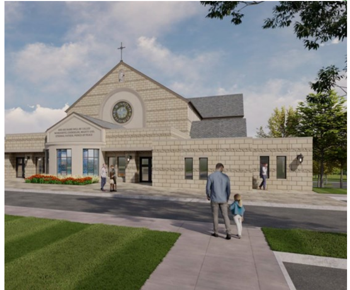
A conceptual design of the west side of the church; gathering space and offices

Having the offices located on the west side of the church will provide easier access to the main body of the church for private prayer, as well as adding much needed security. The main entrance will be monitored by the office staff. Unfortunately, in this day and age, security is of the utmost importance.