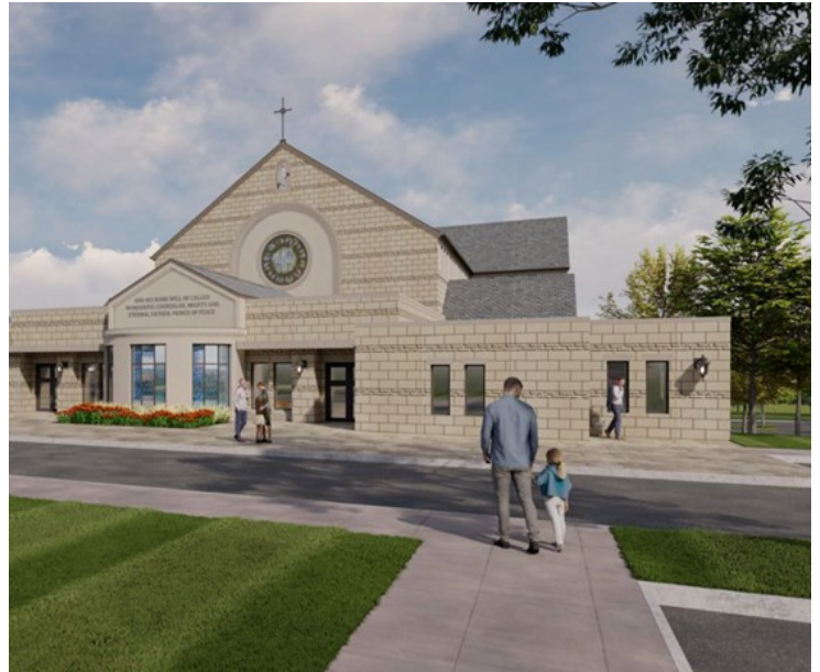
A conceptual design of the west side of the church; gathering space and offices

The Phase II committee continues to meet. As plans become available, they will be shared. Please save the date for January 28th & 29th after all the Masses for Town Hall meetings to discuss the Phase II plans and answer questions. Coffee and donuts will be provided.