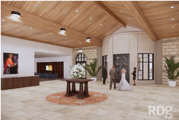
A bride and her father waiting to enter the church. (Imagine the wedding party already in the church.)

Prince of Peace has several weddings each year. The new gathering space will allow wedding parties to have comfortable space in which to wait as they enter into the church. Currently attendants and groomsmen stand in line in the northwest stairway. The bride waits in the vesting sacristy, the small room by the elevator. After weddings, there will be room for a receiving line.