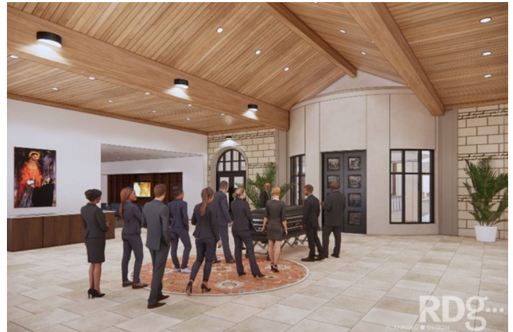
A rendering of a funeral in the new space. It does not include the family of the deceased.

Prince of Peace has several weddings each year. The new gathering space will allow wedding parties to have comfortable space in which to wait as they enter into the church. Currently attendants and groomsmen stand in line in the northwest stairway. The bride waits in the vesting sacristy, the small room by the elevator. After weddings, there will be room for a receiving line.