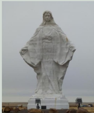
Our Lady of Peace

This summer we are finally able to get back into our regular youth events such as Higher Ground, Totus Tuus, and a few activities we like to do with St. James Youth Ministry. We had youth attend both weeks of Higher Ground and we have several signed up for Higher Ground Extreme Faith for middle school next month.