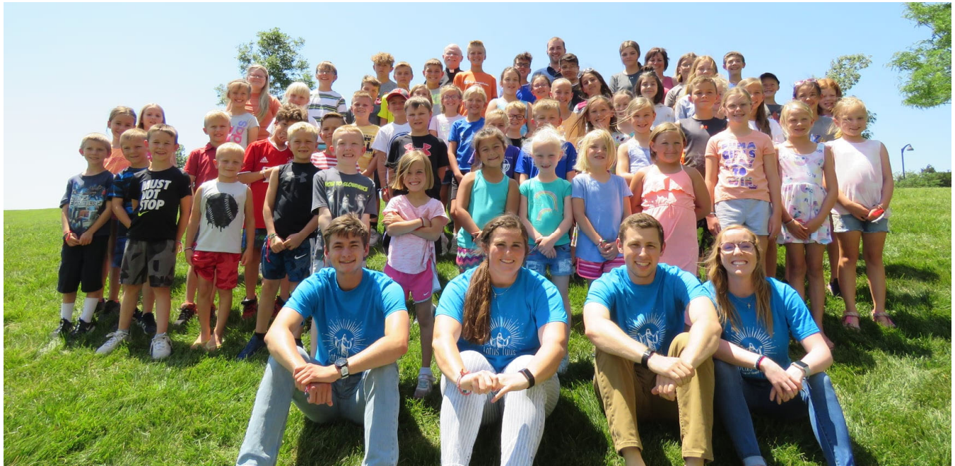
The Totus Tuus kids and leaders take a quick picture before hopping on the water slide!