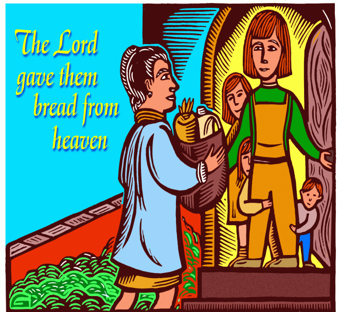
© 2005 J. S. Paluch Company, Inc.

Each of these events will take place at 7:00 at the Old Town Hall (1900 Central Avenue).