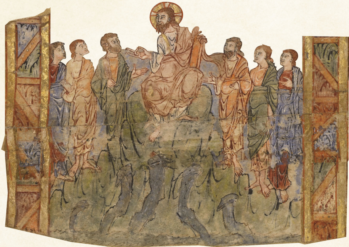
Detail, Anonymous, Christ Teaching , Anglo-Saxon, c. 1000