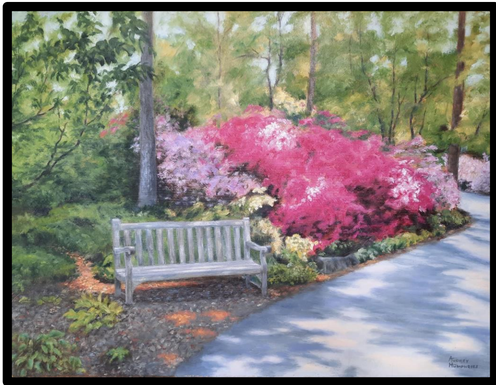
Azaleas , by Audrey Humphries. Used with permission.