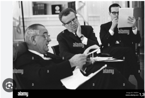
President Lyndon Johnson with political strategist Larry O'Brien and...