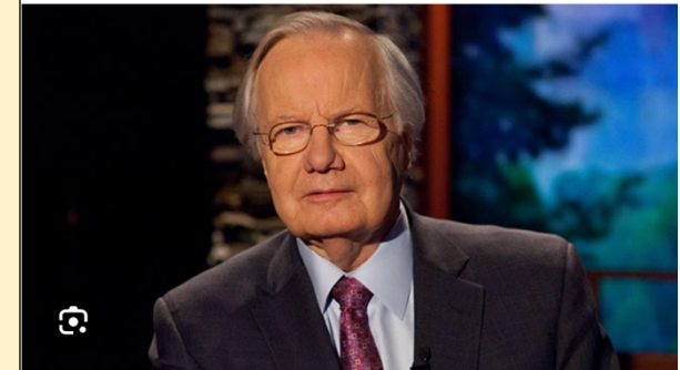
About | BillMoyers.com

Hyperbole was to Lyndon Johnson what oxygen is to life. Bill Moyers