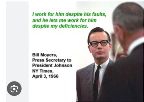
Contact Public Affairs – Lyndon B Johnson National Historical Park...