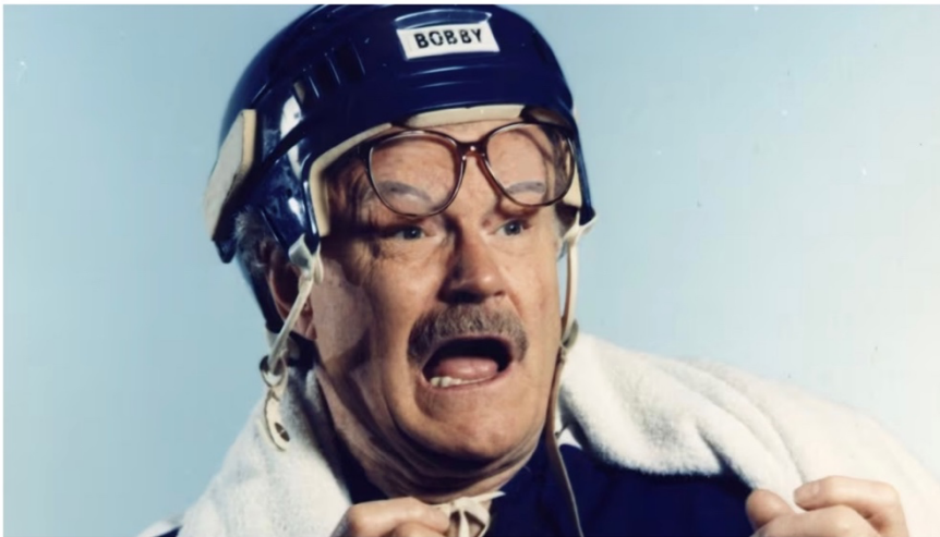
Dave Broadfoot is shown as dozy hockey player Big Bobby Clobber in a publicity still from Dave Broadfoot: Old Enough To Say What I Want.

Big Bobby Clobber, Sgt. Renfrew, the Honourable Member for Kicking Horse Pass, et al.