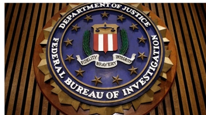
A CREST OF THE FEDERAL BUREAU OF INVESTIGATION IS SEEN INSIDE THE J. EDGAR HOOVER FBI BUILDING IN WASHINGTON, D.C.

February 21, 2024, 10:12am Share Tweet Signal