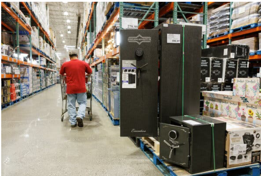
The Anchorage location, Warehouse No. 10, opened in 1984.

Few companies have greater influence over what we eat (or wear, or fuel our cars with, or use for personal hygiene). Costco dominates multiple categories of the food supply — beef, poultry, organic produce, even fine wine from Bordeaux, which it sells more of than any retailer in the world. It is the arbiter of survival for millions of producers, including more than a million cashew farmers in Africa alone. (Costco sells half the world’s cashews.) Its private label, Kirkland, generates more revenue than towering brands like Nike and Coca-Cola.