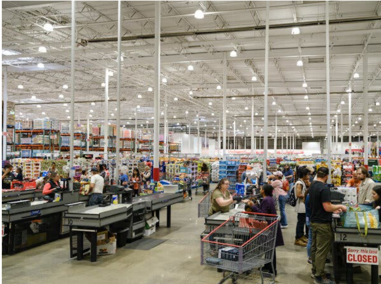
A Costco store in Anchorage. The average size of a warehouse is 147,000 square feet.