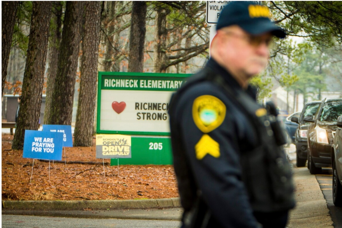
A Newport News police officer directs traffic at Richneck Elementary School on Jan. 30.