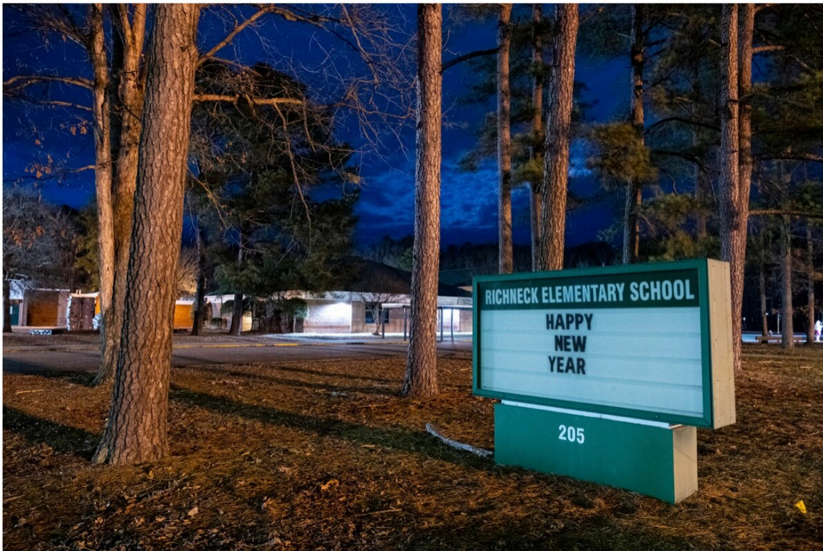
Richneck Elementary on Jan. 6, the day of the shooting.

Early this fall, as Richneck teachers sought to settle their new crop of students inside the low-slung red-brick building nestled amid trees, news of the 6-year-old’s troubled history circulated swiftly among the staff, according to text messages between teachers.