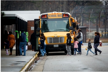
Children arrive at Richneck Elementary School on Jan. 30 for the first day of classes held at the school since the shooting.