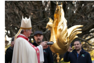
Laurent Ulrich, the archbishop of Paris, places relics inside the golden rooster during its blessing on Dec. 16.