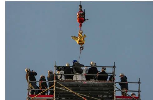
A crane lifts the new rooster to the top of the rebuilt spire on Dec. 16.

Now, I ask you, what kind of country has a rooster for a national symbol, and puts it on top of its greatest cathedral? The “mighty fighting cock” is still just a chicken fit for the pot! No wonder France succumbed to the German eagle so quickly! This should get some Gallic danders up! (How’s my Grade 10 French? Affreux? )