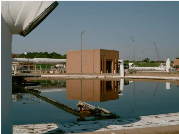
The Village Creek Waste Water Treatment Plant in Fort Worth.