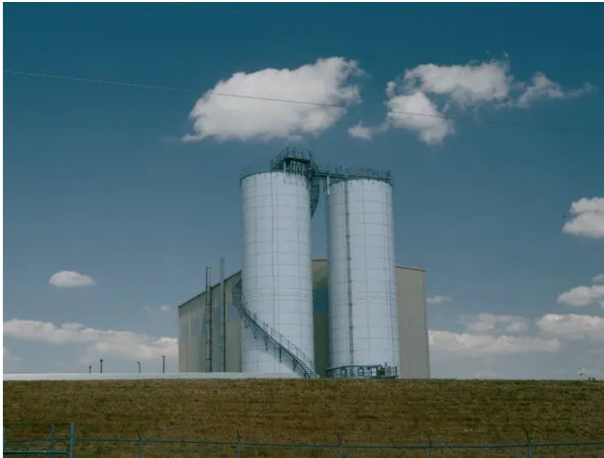
A Synagro processing facility in Fort Worth.

When the E.P.A. started promoting sludge as nutrient-rich fertilizer decades ago, it seemed like a good idea.