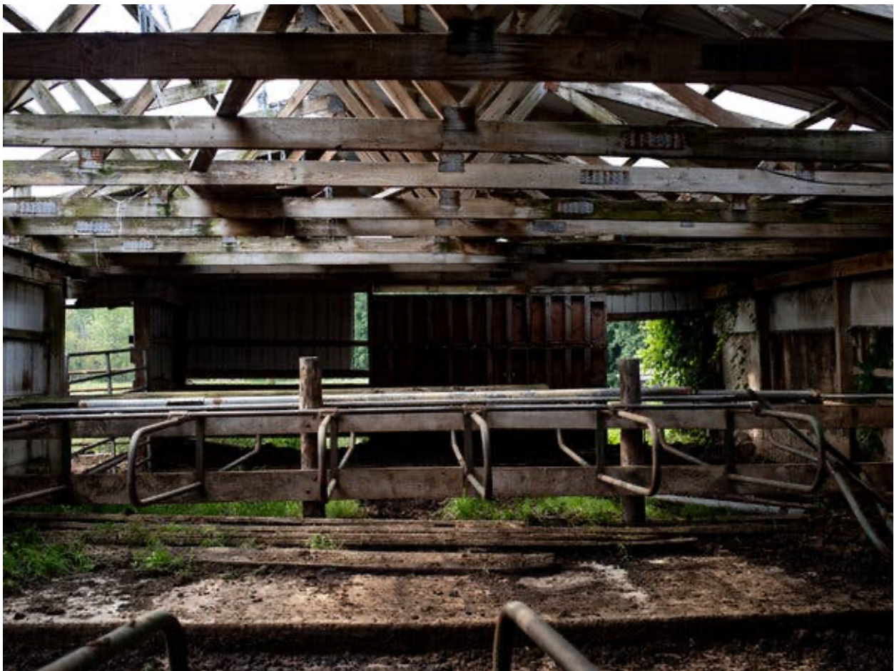
A cattle barn in Michigan, now empty, after the land and the animals were found to be contaminated.

Michigan hasn't conducted widespread testing at other farms, partly out of concern for the economic effects on its agriculture industry.