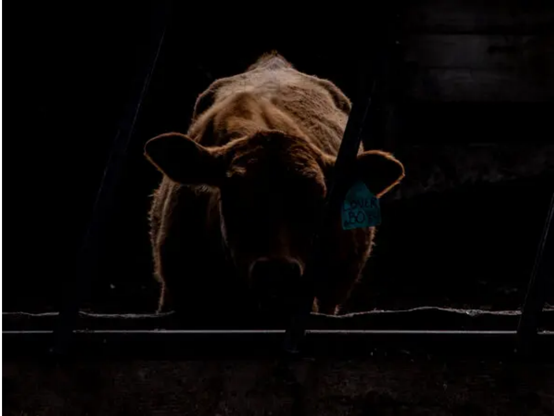
One of the animals from the contaminated herd Michigan.