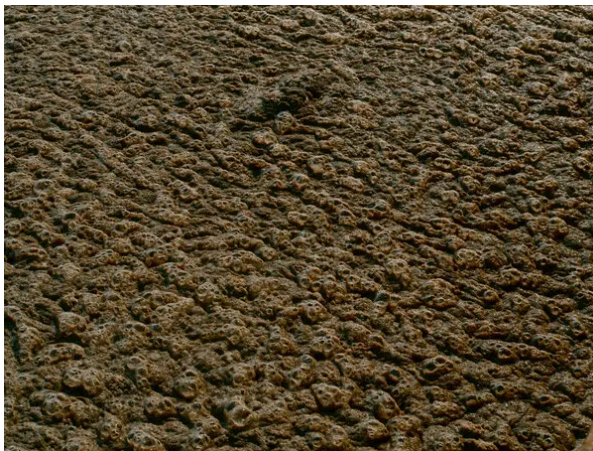
Sewage on the journey to becoming sludge fertilizer in Texas.

E.P.A.'s own researchers have found elevated levels in sewage sludge. And in the agency's most recent survey of biosolids , PFAS were almost universal.