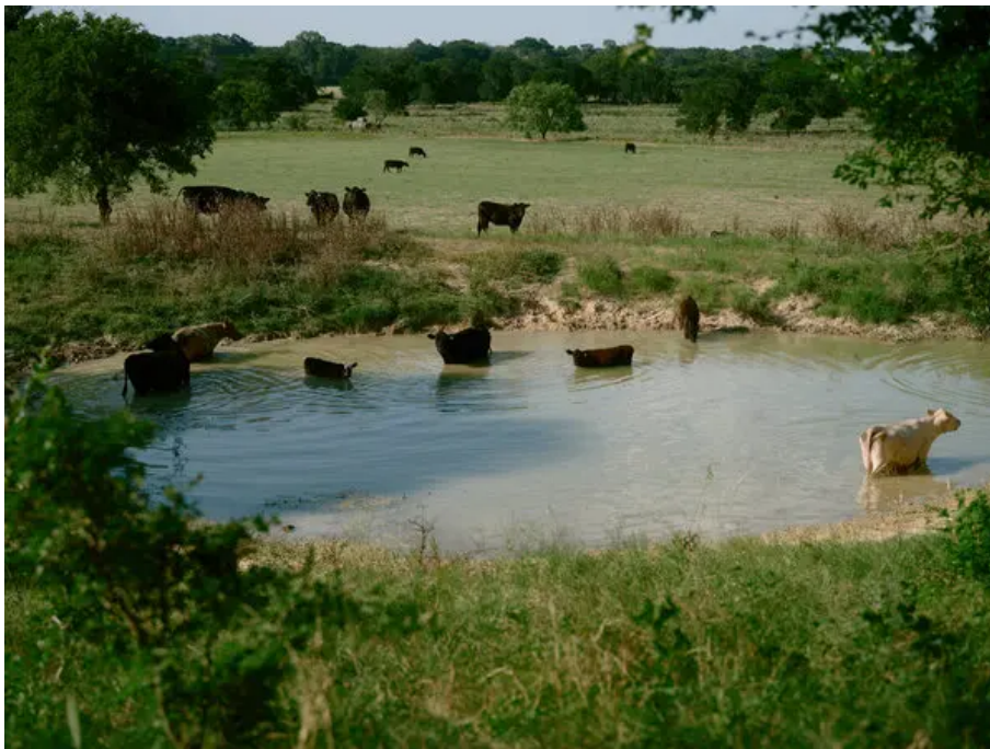
A watering hole on the Coleman farm.