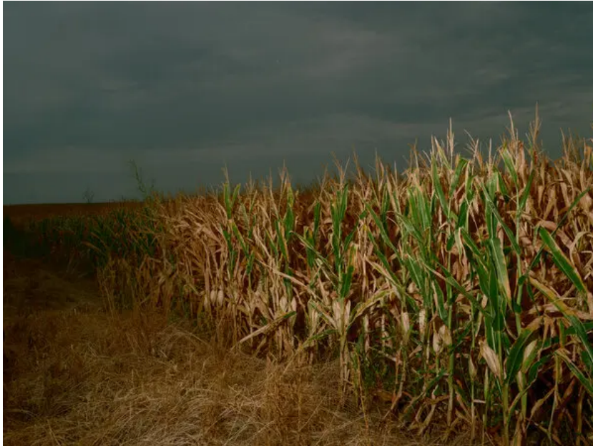
A Texas field fertilized with biosolids from Synagro.

Research has shown that PFAS can enter the human food chain from contaminated crops and livestock.