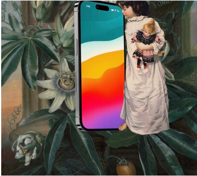
(Illustration by Anna Bu Kilewer for The Washington Post; Library of Congress; Wikimedia)