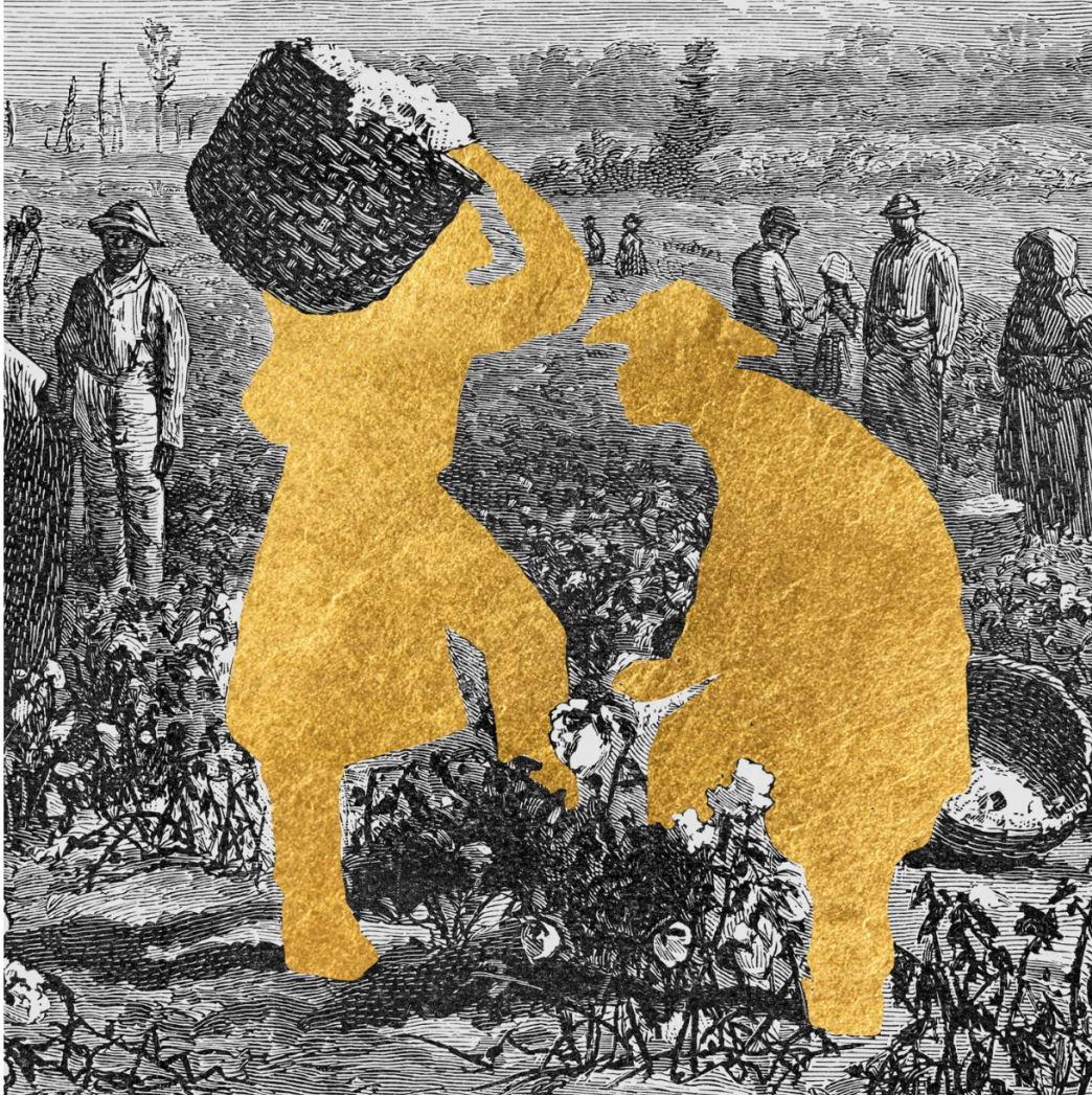
Illustration by Sam Whitney/The New York Times