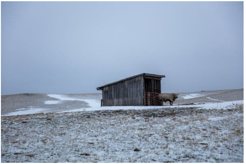
A cattle ranch neighboring the reserve.