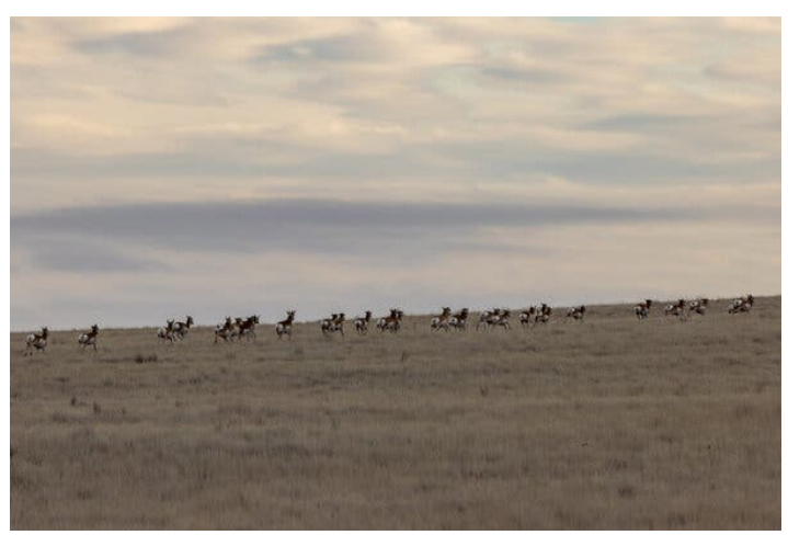
A herd of pronghorns running on the reserve.

Montana, including the Fort Belknap Reservation and Blackfeet Nation, already have herds of their own.