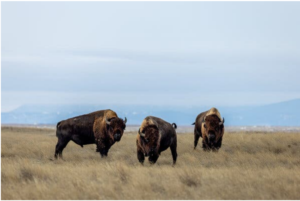
Three of the bison on the American Prairie reserve in Montana. Between 30 million and 60 million bison once roamed the United States.