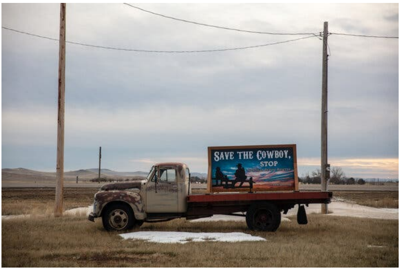
A sign stating opposition to the reserve on the side of a highway.

While cattle can be managed to mimic some of these benefits, bison do so naturally.