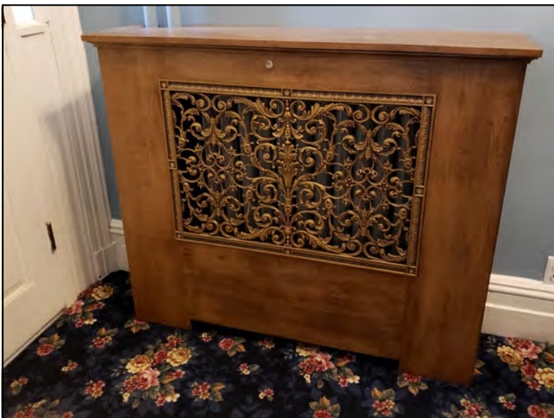
RR-203 20x30 Radiator Grille in Umber Gold Finish