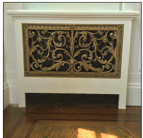
RR-203 10x24 Radiator Grille Antique Brass