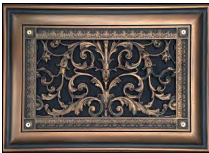
FV-203 08x14 Foundation Vent

In a world where homes are built with the finest materials, some common items still stand out as everyday "eyesores". Some of these items include, heating and air conditioning grilles, foundation vents, bathroom ventilation fans, and uncovered radiators. Practical solutions for crawlspace vents include these two Louis XIV deluxe foundation grilles, FV-203 as shown to the left and right. They are unique as they are the only high end foundation vent covers available.