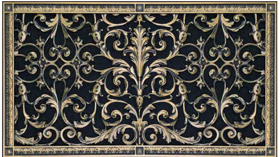
RR-203 16x30 Grille in Antique Brass Finish