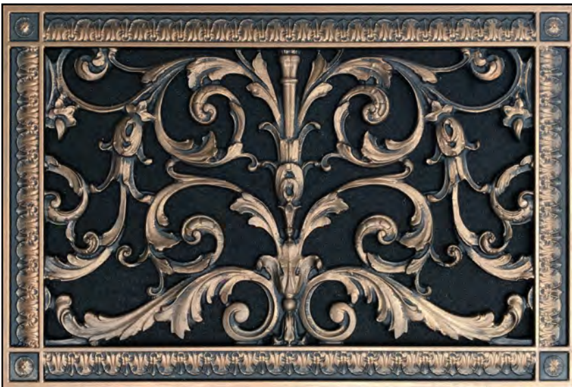
RR-203 10x16 Grille in Rubbed Bronze Finish

Uncovered radiators are less efficient as a radiator in a cabinet. An enclosed radiator heats the room to higher temperatures by drawing cold air off the floor.