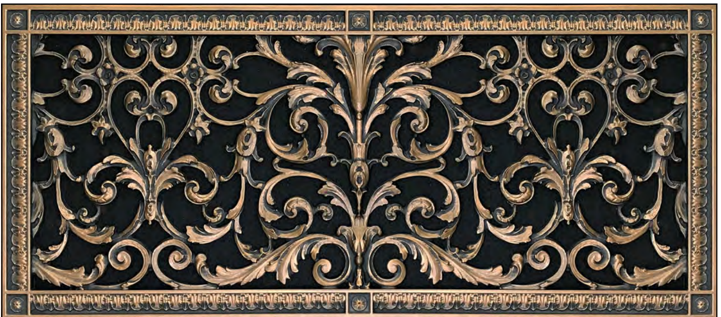
RR-203 12x30 Grille in Rubbed Bronze Finish

The above grille is a French Style Louis XIV magnetic filter grille MFG-203 12x20 Notice that you cannot see the filter, hinges, latches or even hardware.