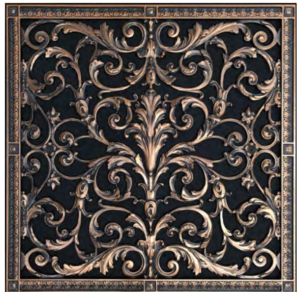
RR-203 20x24 Grille in Rubbed Bronze Finish