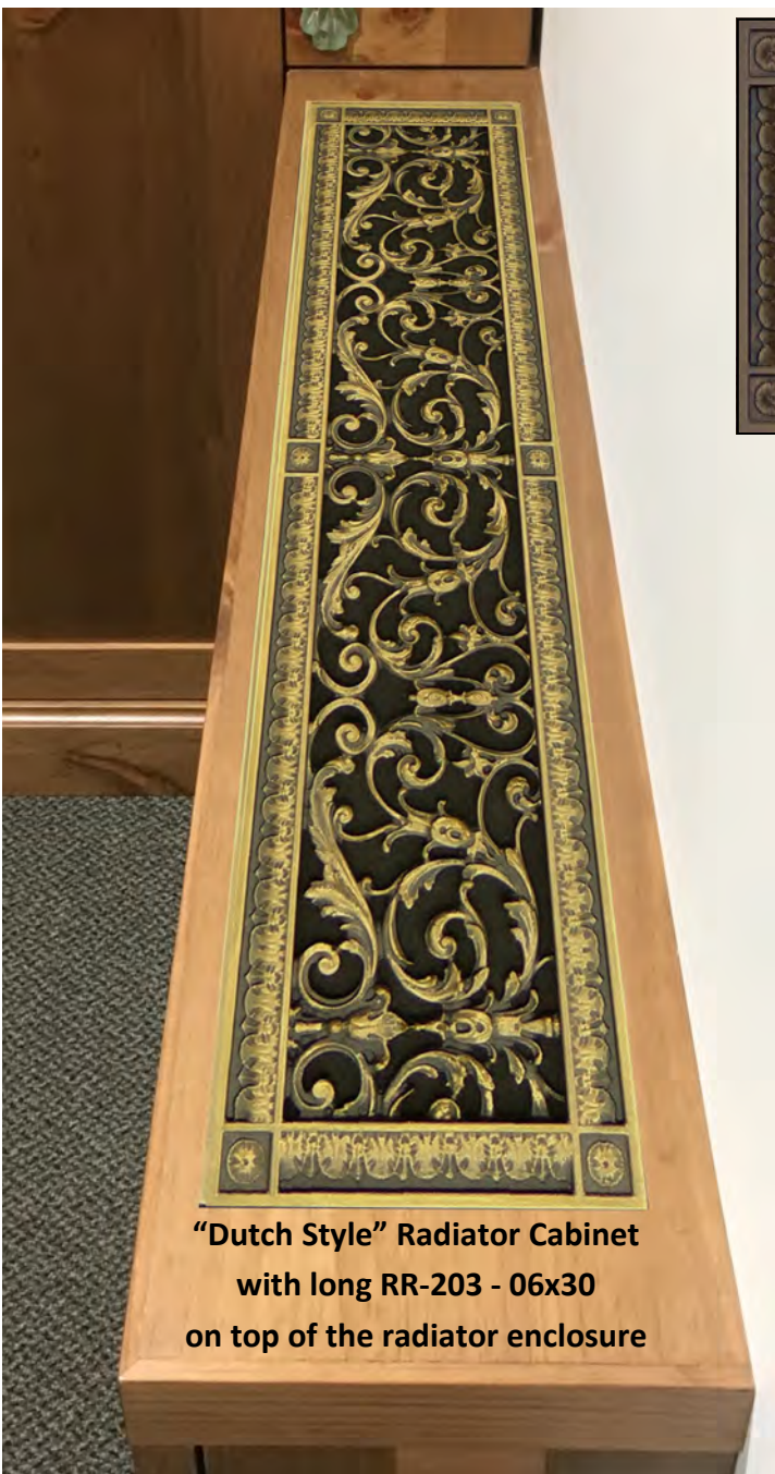
"Dutch Style" Radiator Cabinet with long RR-203 - 06x30 on top of the radiator enclosure