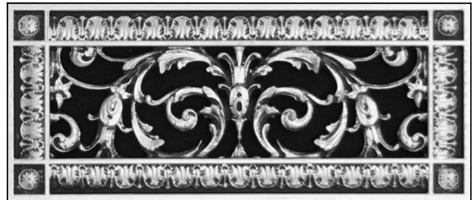
RR-203 04x14 Louis XIV Grille in Nickel Finish