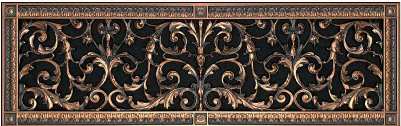
RR-203 08x30 Grille in Rubbed Bronze Finish