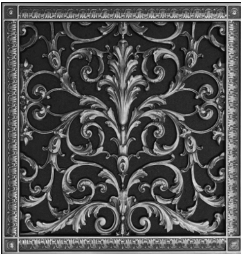
RR-203 16x16 Grille in Pewter

The basic design feature of the Louis XIV Style is the leaves of the Acanthus plant. It became important part of Ancient Greek culture because of its medicinal qualities. In time the Acanthus leaf became a symbol of long life and immortality. In Greek Architecture it was first used on the column capitals on the 5th century BC Temple of Apollo Epicurus. Later these capitals became the part of highest order of Greek Architecture: Corinthian. The Romans also featured Acanthus in their Architecture.