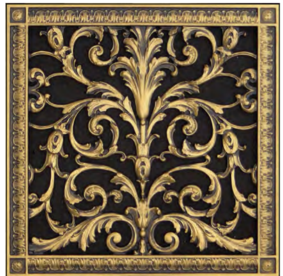
RR-203 14x14 Grille in Antique Brass