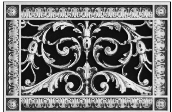
RR-20 06x10 Grille in Nickel Finish