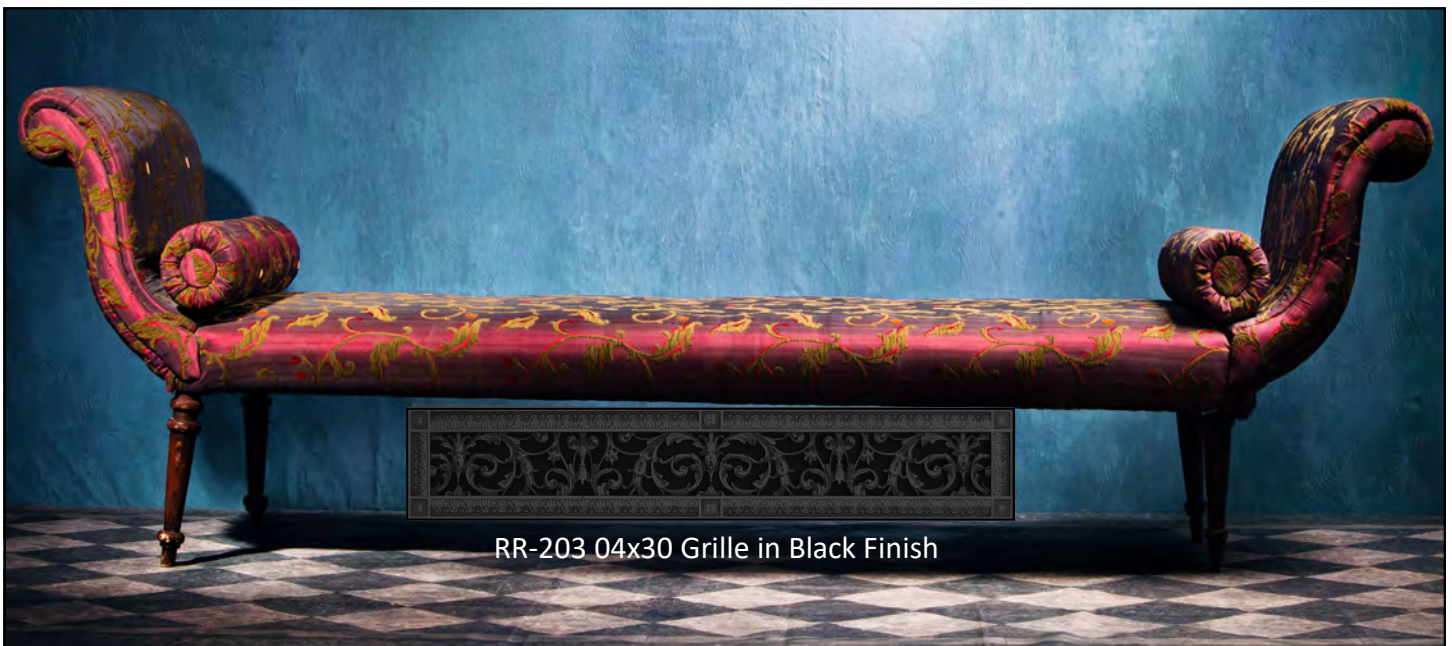
RR-203 04x30 Grille in Black Finish