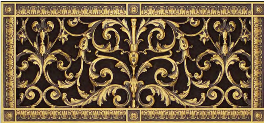
RR-203 08x24 Grille in Antique Brass Finish