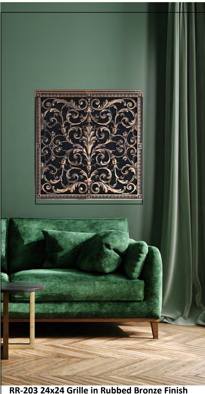
RR-203 24x24 Grille in Rubbed Bronze Finish