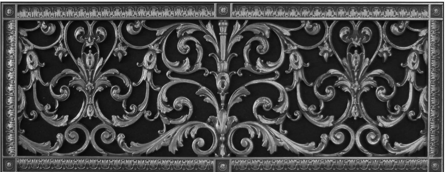
RR-203 10x30 Grille in Pewter Finish