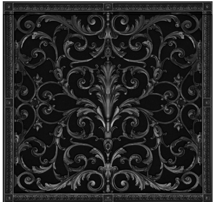
RR-203 24x24 Grille in Black Finish