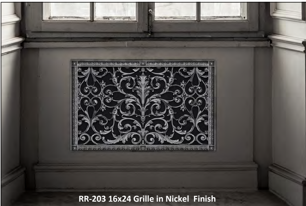
RR-203 16x24 Grille in Nickel Finish

As centuries passed Acanthus leaves became more and more stylized growing upward with spiraling offshoots similar to how new leaves unfolded on the actual Acanthus plant. In the Louis XIV Grille design the center plume looks most like the actual Acanthus leaf. The spirals or Rinceaux as the French say, became the dominate design representing growth. Note the Louis XIV Grille photo above shows no less than 20 very stylized Rinceaux. In many respects the Acanthus is immortalized in all classical architecture.