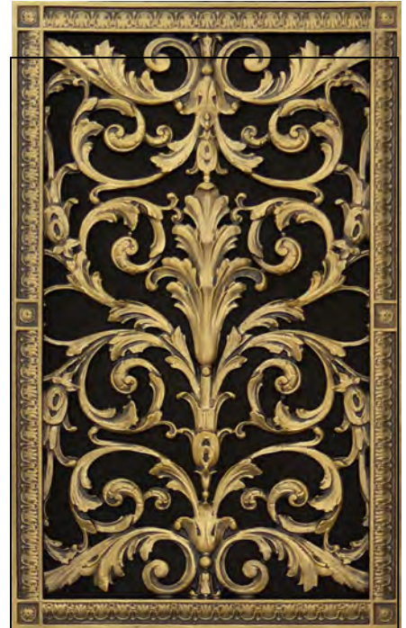
RR-203 24x24 Grille Antique Brass

The elements of a room in those days were windows entrance ways, fire places doors, staircases, ceilings, floors and walls. In many respects those classical influences still exist today. However new elements such as electrical lighting, radiators, forced air heat, and TVs were introduced at times when decoration was passé . Just imagine how the room to the left would look with a large white louvered grille.