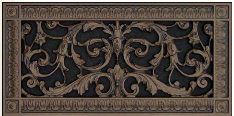
RR-203 06x14 Grille in Dark Bronze