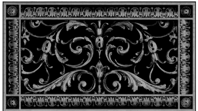
RR-20 06x12 Grille in pewter Finish