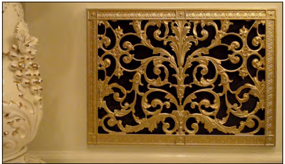
RR-203 12x30 Grille in Antique Brass

The above grille is a French Style Louis XIV magnetic filter grille MFG-203 12x20 Notice that you cannot see the filter, hinges, latches or even hardware.