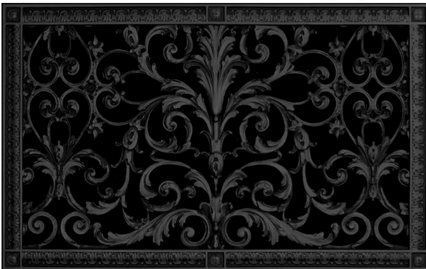
RR-203 14x24 Grille in a Black Finish

The photo above shows wainscoting and carpenter box panels with a Louis XIV Return Air HVAC Grille RR-203 14x24 in Antique Brass. Since you can see through decorative grilles, we strongly recommend that you paint the ductwork flat black before attaching the grille. The flat black paint on the ducts absorbs light rather than reflects light, therefore making the ductwork visually disappear.