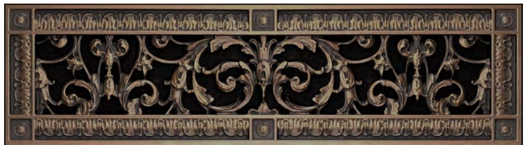
RR-203 04x24 Grille In Rubbed Bronze Finish