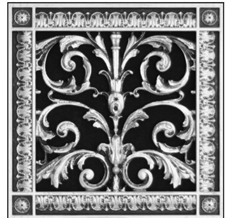
RR-203 08x08 Grille in Nickel