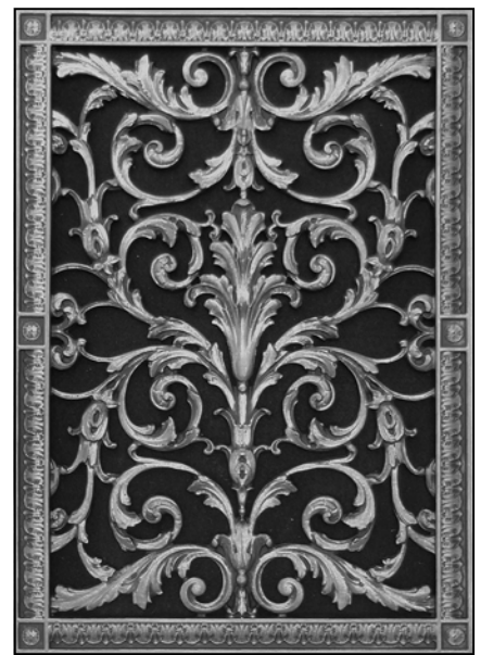
RR-203 20x14 Grille in Pewter