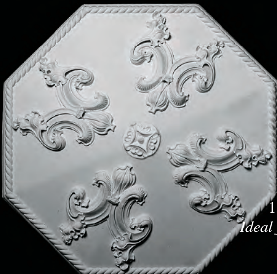
MD-105 15-1/4" diam. x 2-1/2" Ideal for Ceiling Design 1-RD3. See Ceilings Page 8