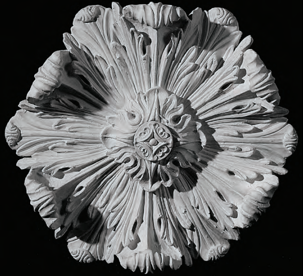
MD-103 10-1/2" diam. x 2-1/4"