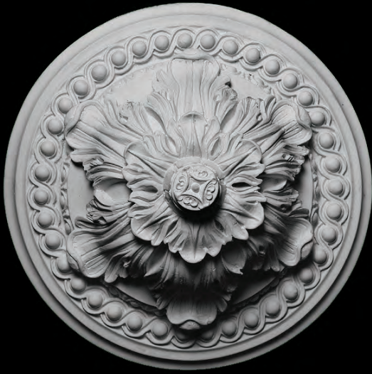
MD-100 12-1/2" diam. x 5"