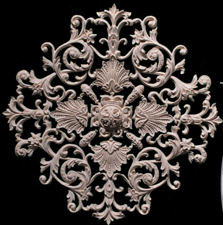
MD-101A 20" diameter x 7/8" Thick