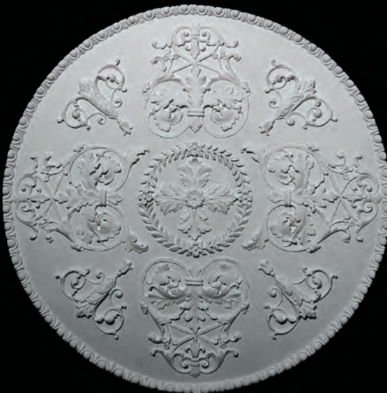
MD-102 18" diam. x 3/4"