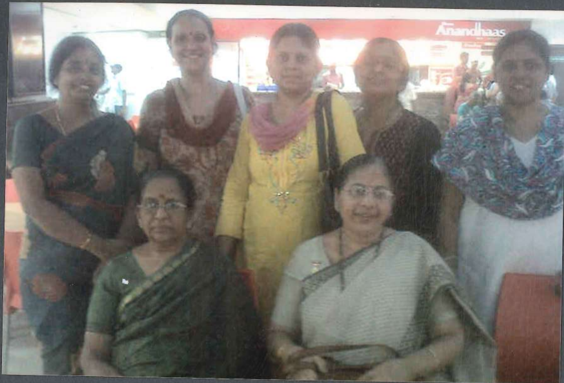
MOVIE AT BROOKFIELD'S MALL