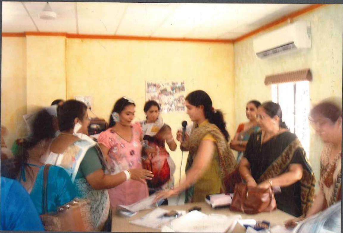
CAMBS AT THE MEETING