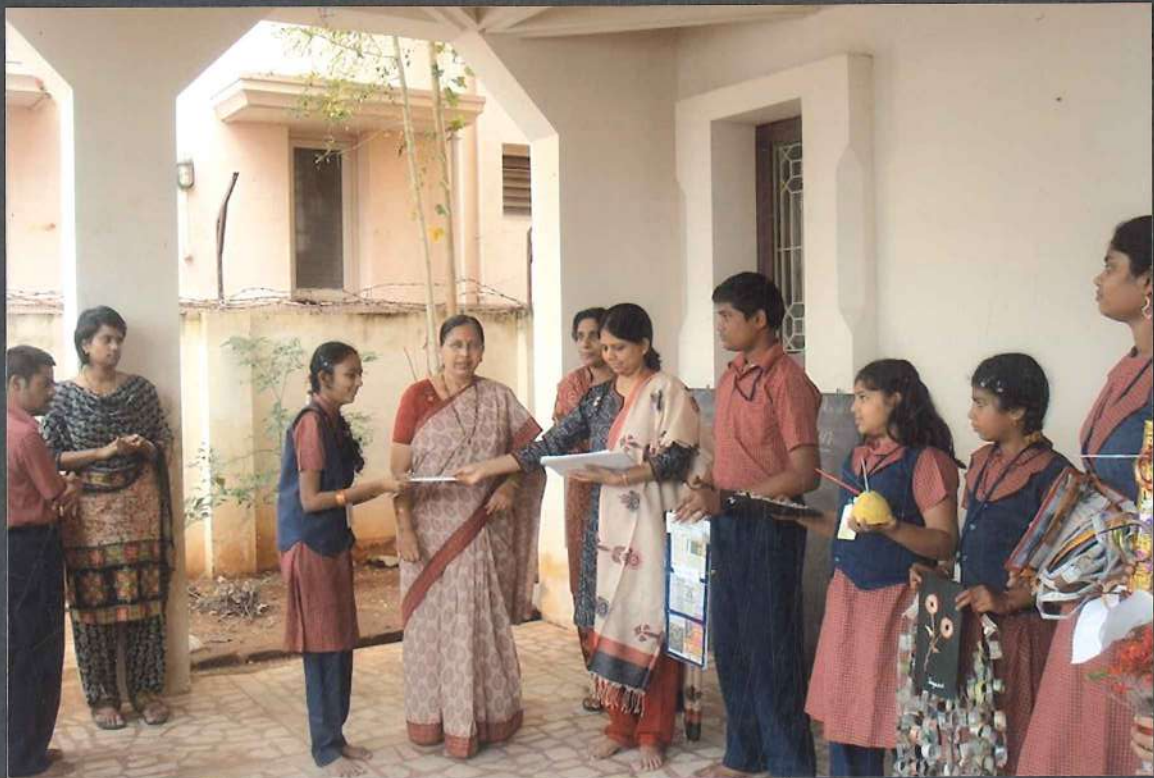
CERTIFICATES GIVEN TO PARTICIPANTS