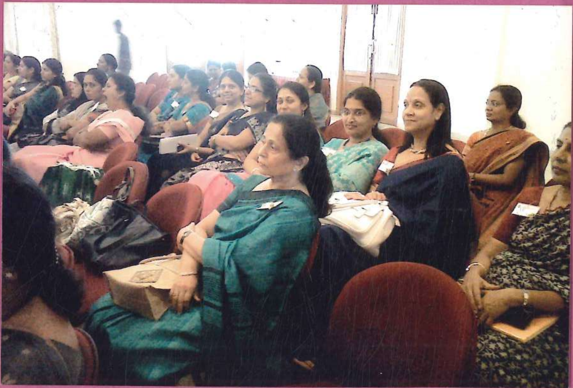
OUR CLUB MEMBERS AT ASSEMBLY