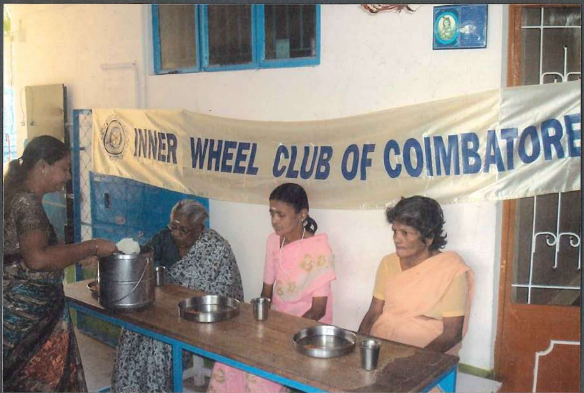
ANNADANAM AT OLD AGE HOME