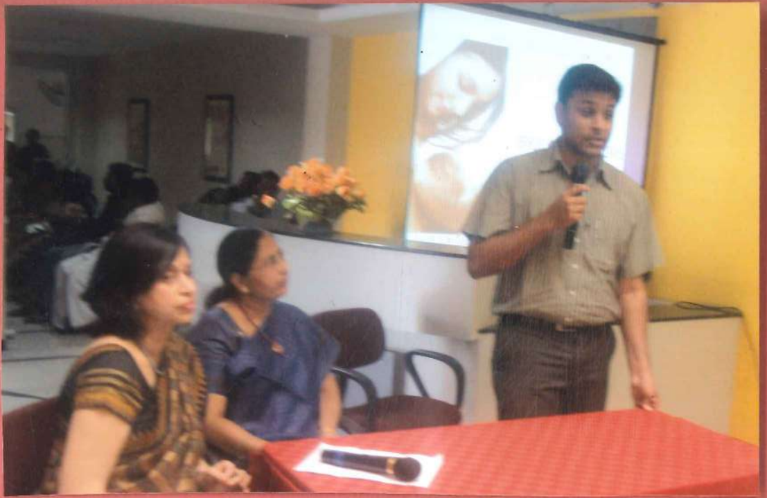
RAO HOSPITAL SLIDE SHOW