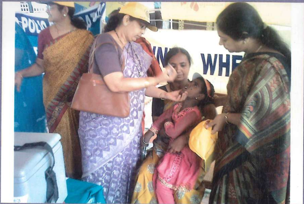
PULSE POLIO AT SCM HOME IN FEBRUARY