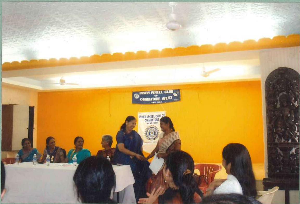
JOINT MEETING AT SUDHARAM HOTEL