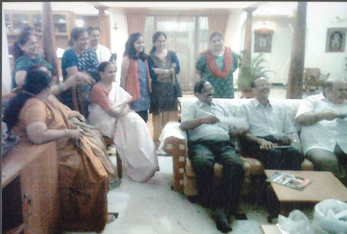
FAMILY GET TOGETHER