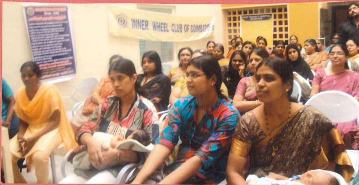
RAO HOSPITAL Q & A SESSION