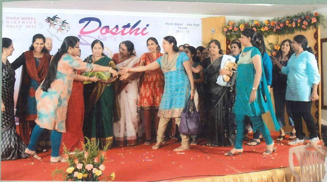
PRIZE WON FOR BEST DANCE AND MAXIMUM REGISTRA TION