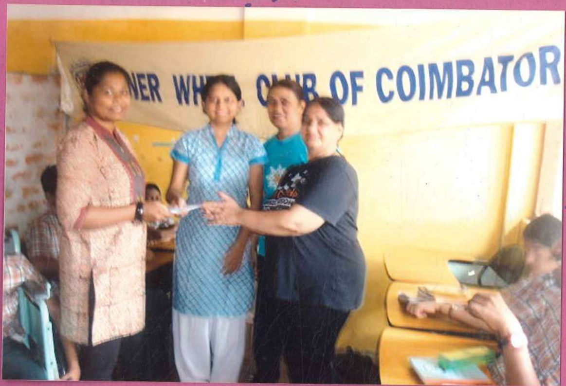
DONATION TO DEAF & DUMB SCHOOL