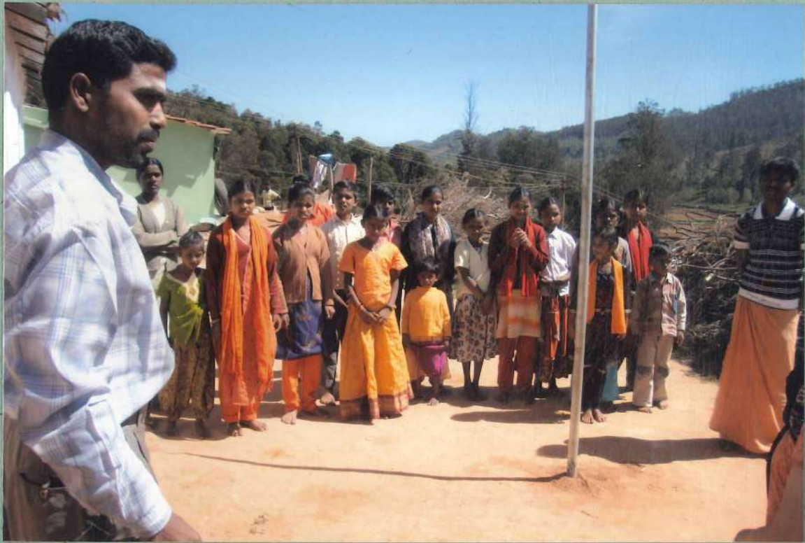
MANIYAD VILLAGE ADOPTED