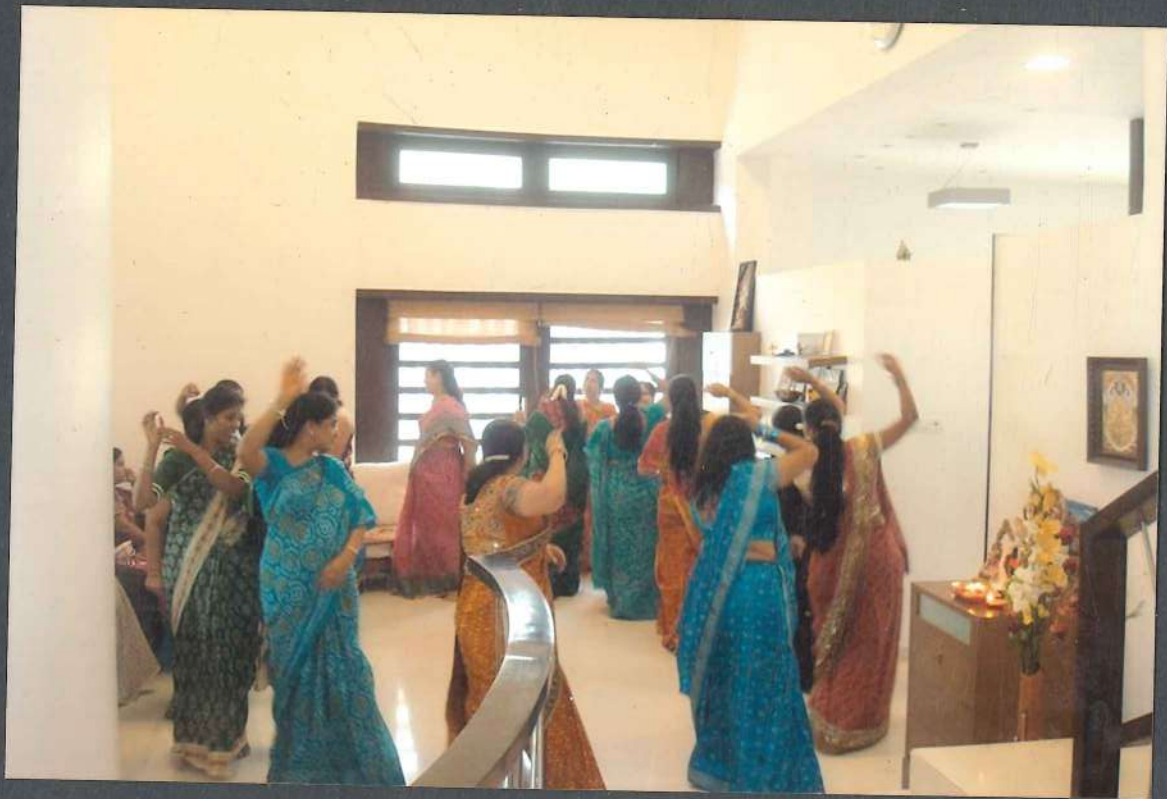
MEMBERS CELEBRATING NAVRATRI DOING GARBA DANCE