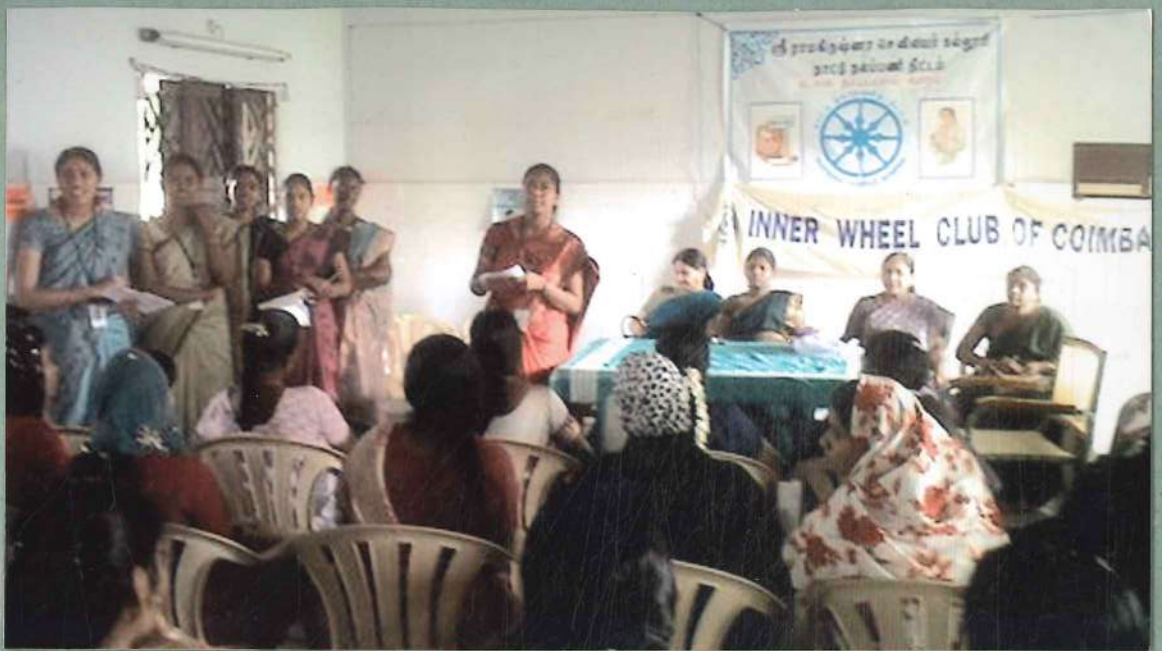
TALK AT SLM HOME