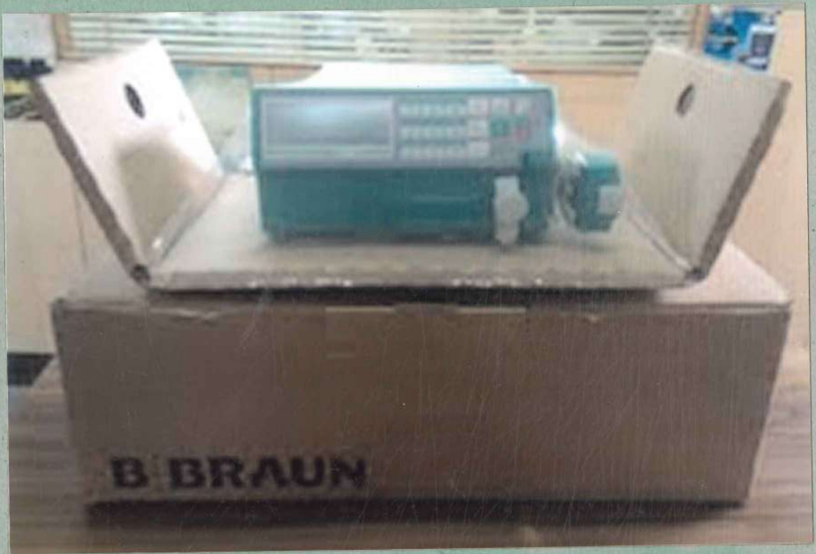
DONATION OF INFUSION SYRINGE PUMP TO GENERAL HOSPITAL