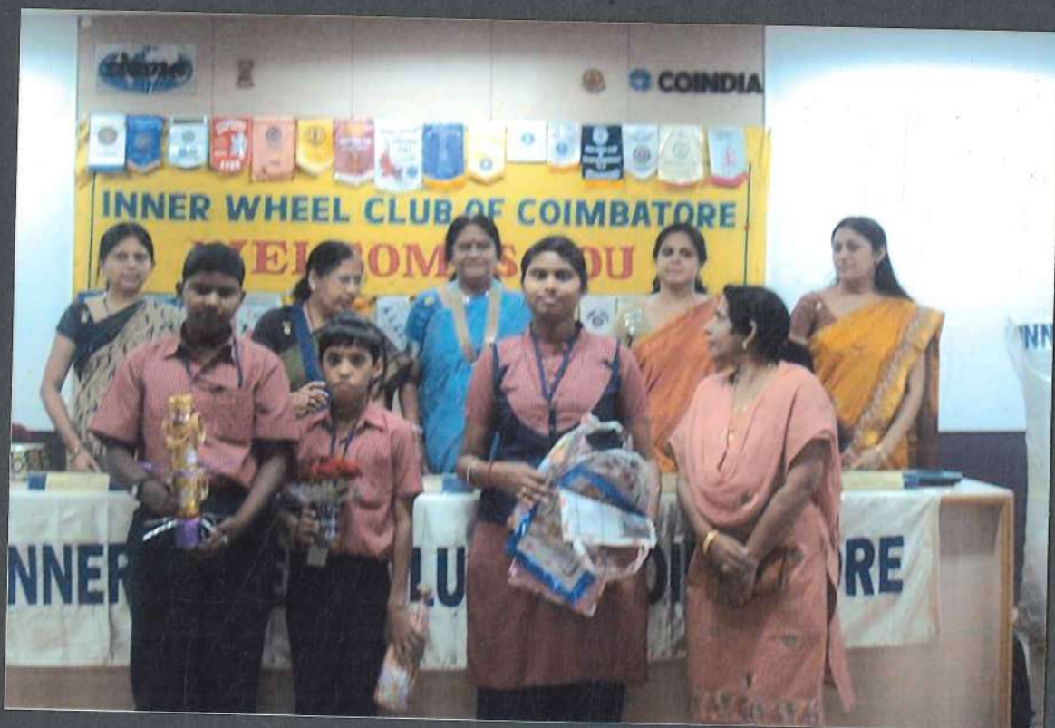
WINNERS OF BEST FROM WASTE COMPETITION