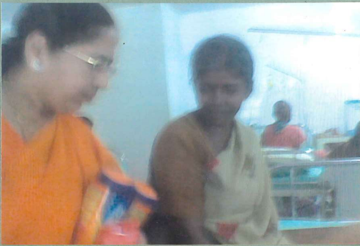
HORLICKS & PAINTING BOOKS GIVEN TO CHILDREN IN RAMAKRISHNA HOSPITAL