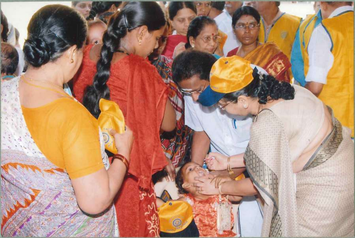
PULSE POLIO IMMUNISATION DAY AT SLM HOME ON 1-4-2012