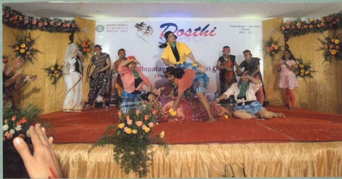
DISTRICT RALLY DANCE ITEM