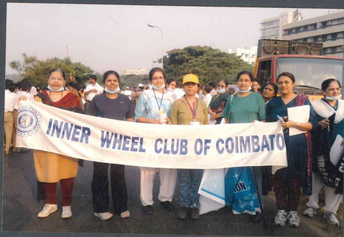
WALK ON WATER DAY