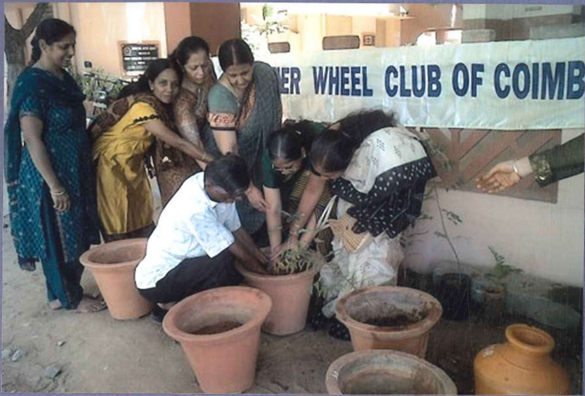
TREE PLANTING AT KVICANI SCHOOL