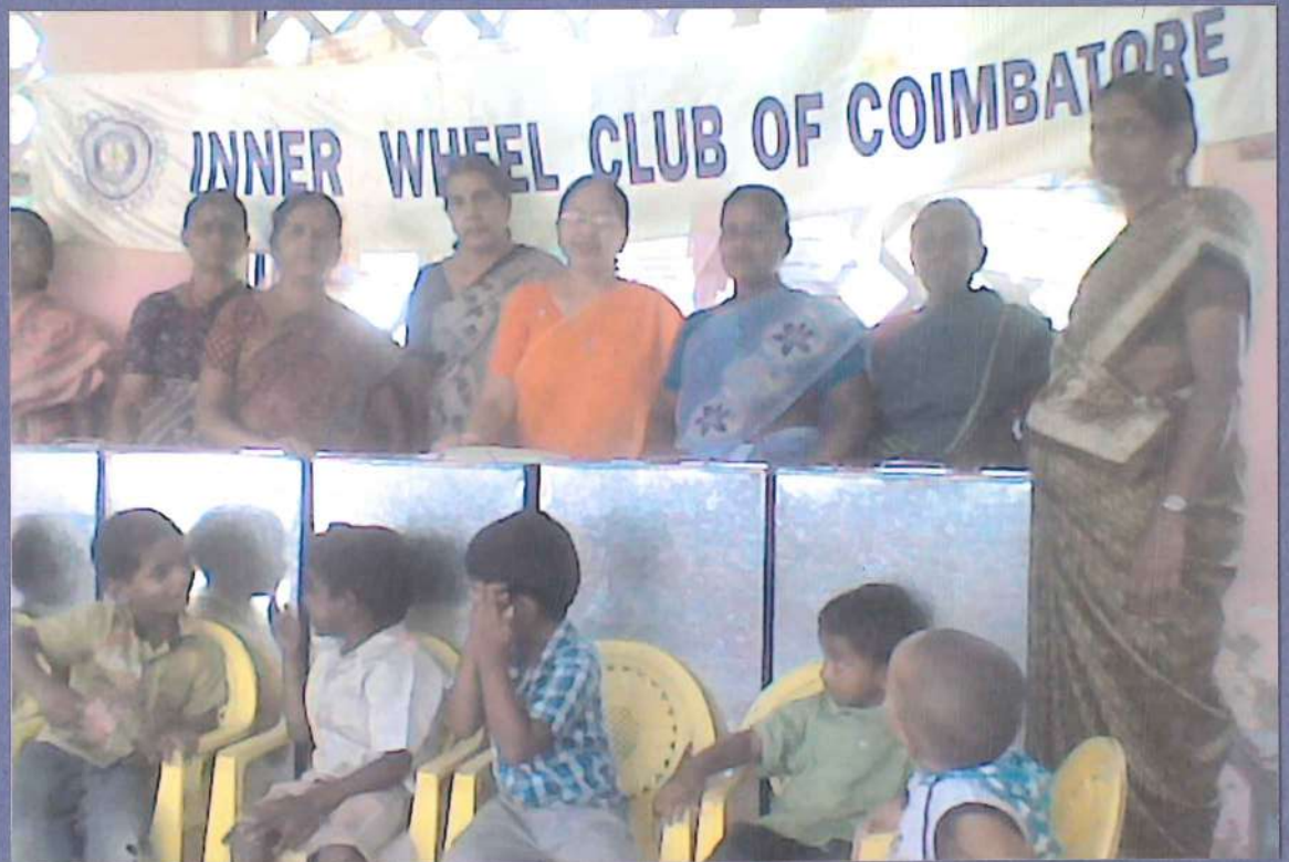
FIVE STORAGE CONTAINERS GIVEN TO ICDS (ANJANWADI)