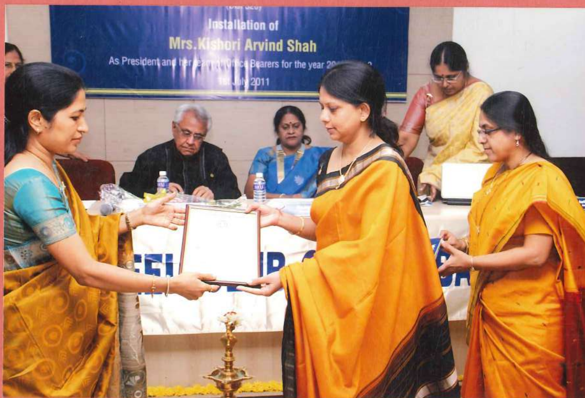
EXCHANGE OF CHARTER