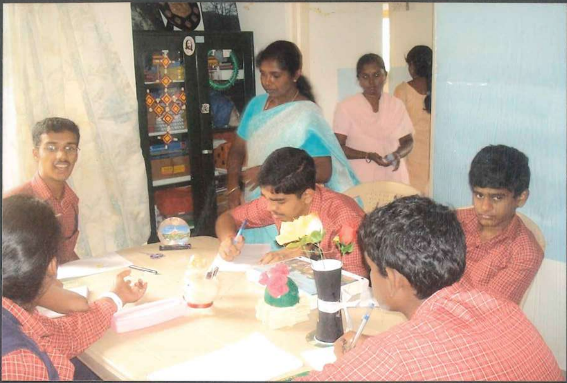
BEST FROM WASTE COMPETITION