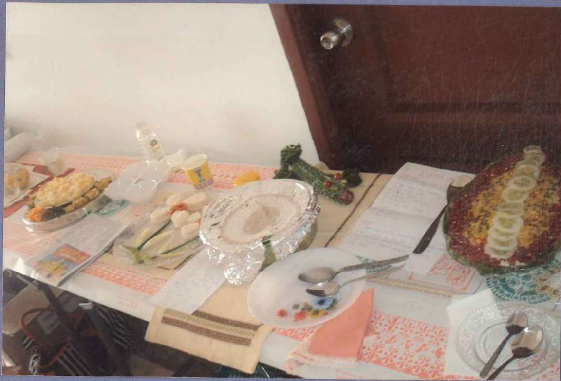
HEALTHY SALAD COMPETITION