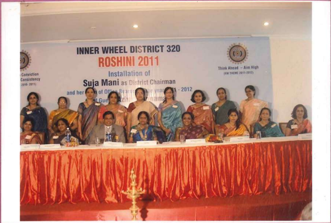
DISTRICT TEAM 2011-12