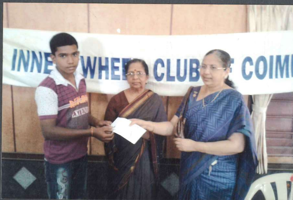
COLLEGE PGDS TO A STUDENT