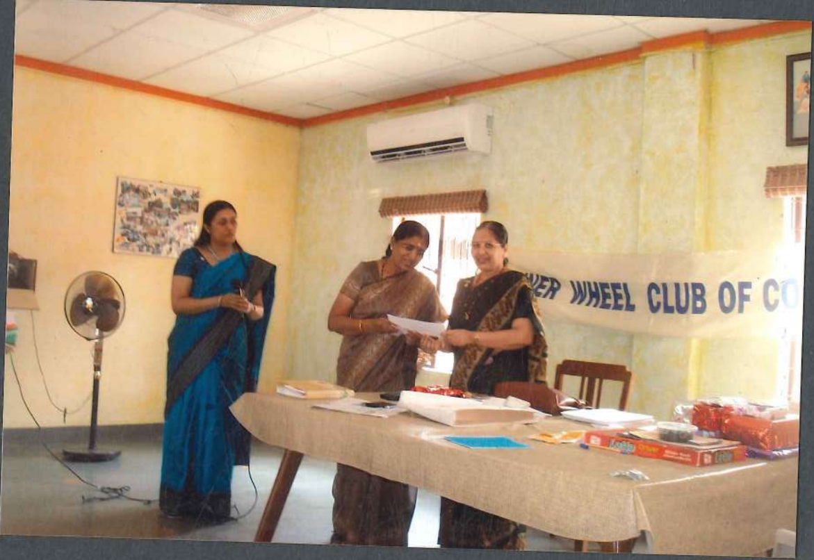
CHEQUE GIVEN TO SHIVASHANTA HOSPITAL