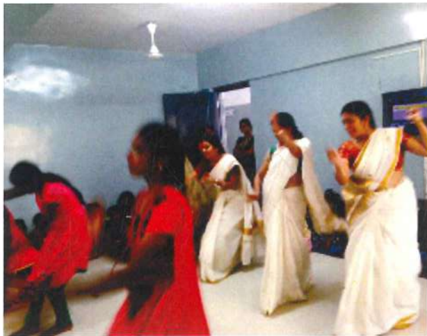
Dancing with Thalir children

We played with them, danced with them and had lunch with them. More than the enjoyment , its the feel of satisfaction which matters the most at the end of the day.