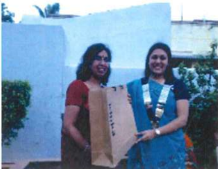
Chief guest with our President