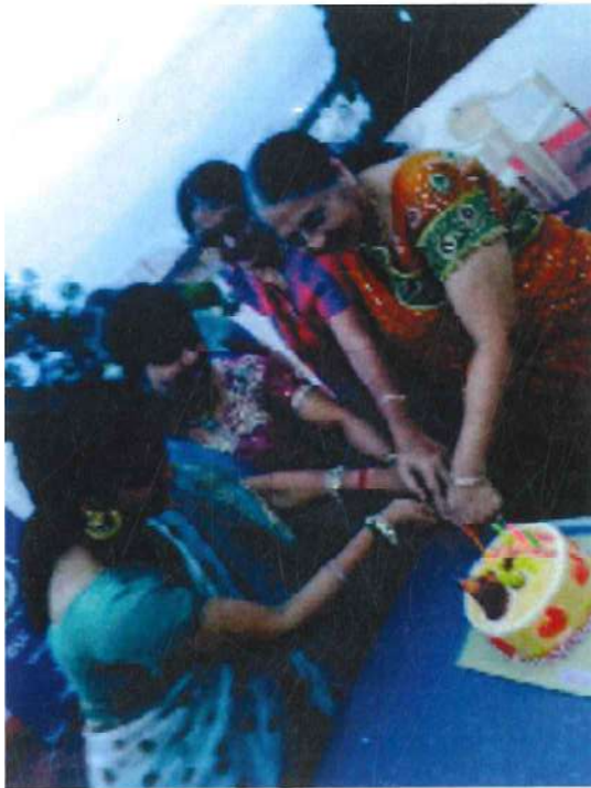
September month birthday babies