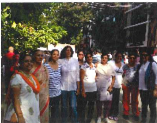
Members at happy streets

Many of our members participated in the Happy Streets Events which was held at Coimbatore