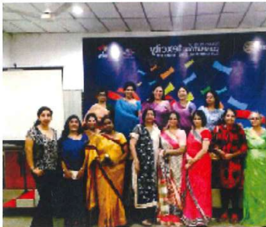
Our members at the meeting