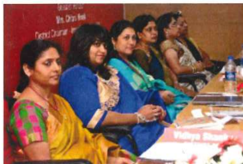
With the Chief Guest & Guest of Honour