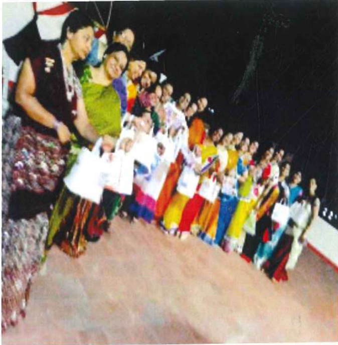
No plastic drive