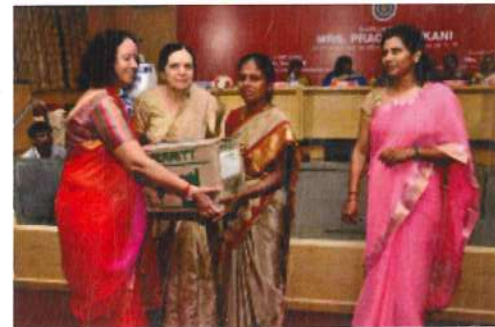
Donation of Sewing Machine