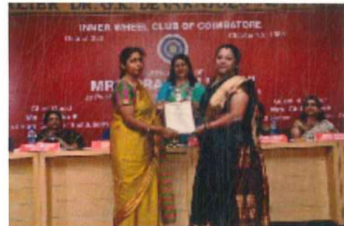
Secretaries exchanging the Club Charter