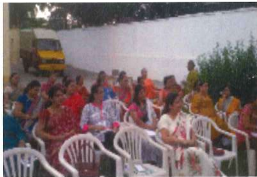
Members at the meeting