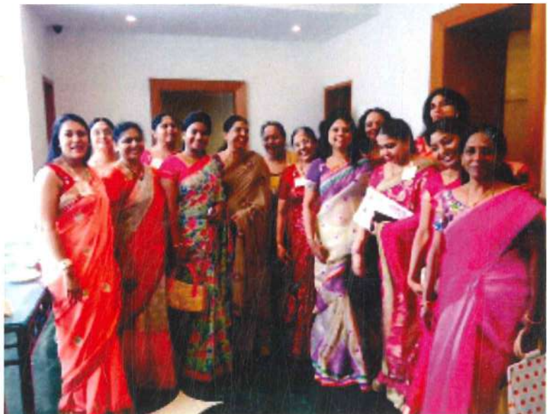
Our members at Sakhyam