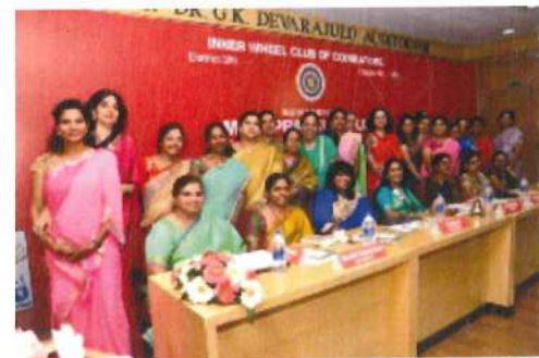
New office bearers of the club