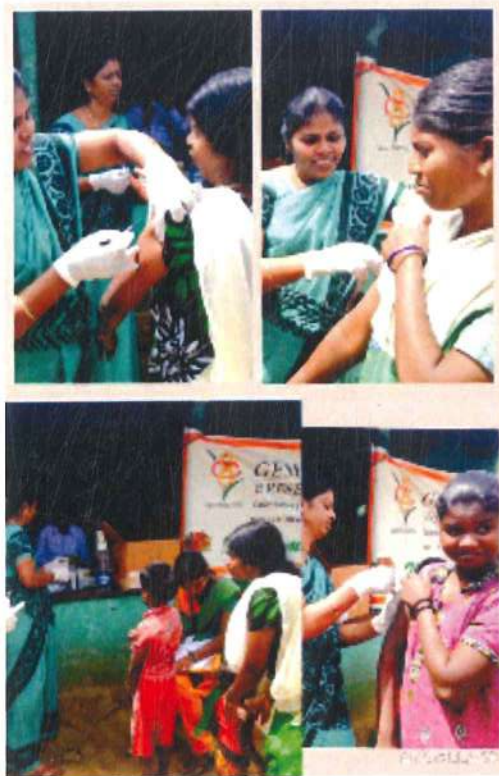
At Gopanari village