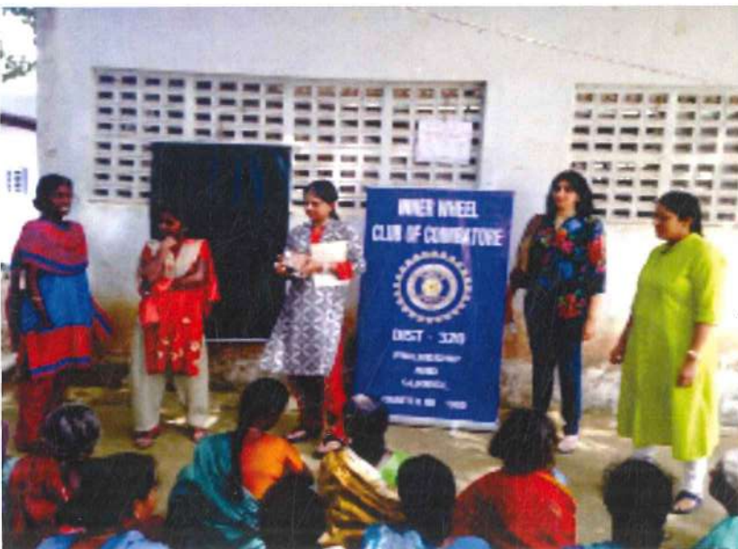
The tribal people being taught