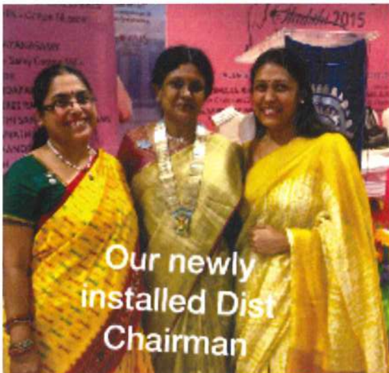
President and President Elect with the DC