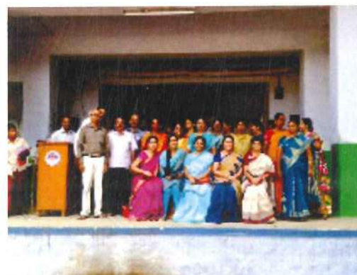
Teachers who were felicitated