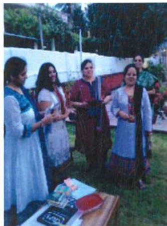
Induction of new members