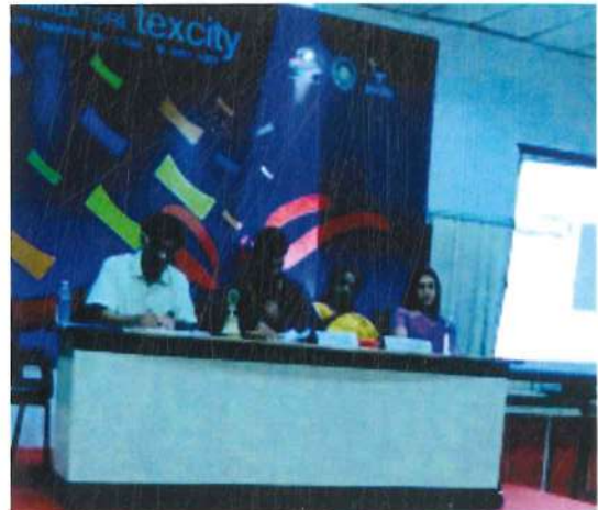
Meeting in progress