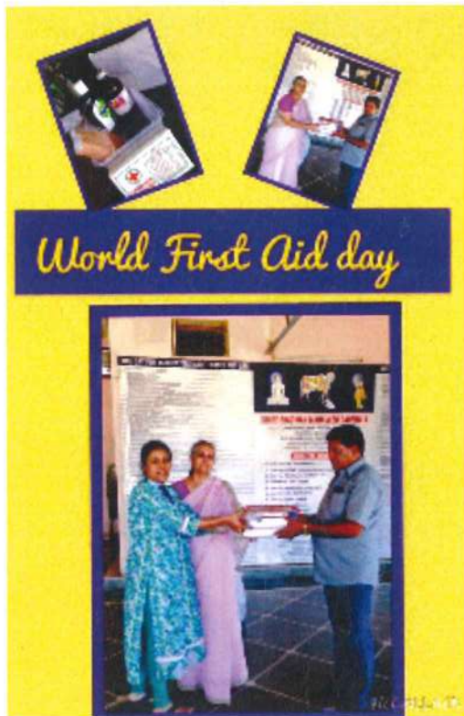
At Mahaveer Gaushala

On September 12th , being the World First Aid Day, HEPATITIS B vaccination was given to 80 rural adults and kids at Kalanipuddur and Gopanari villages, Aanaikatti. A First Aid Box was also donated to the village. Donation of First Aid Box and old clothes to Mahaveer Gaushala was done on the same day.