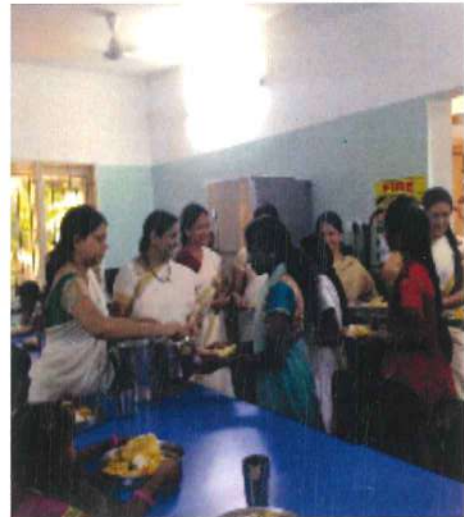
Distribution of lunch