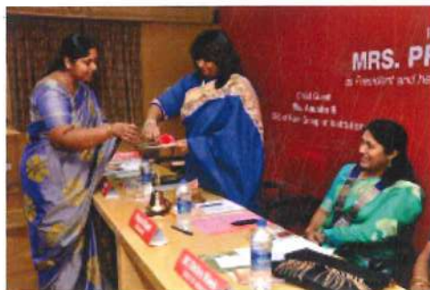
Release of club Bullet in