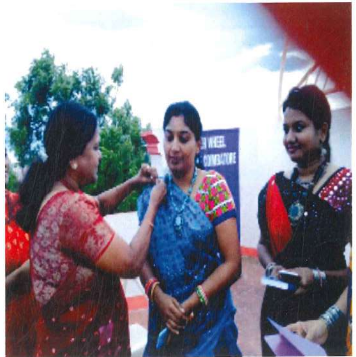
Induction of new members