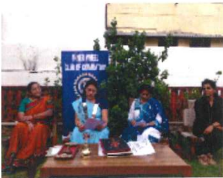
Meeting on progress

Meeting was followed by a healthy dinner based on Organic foods