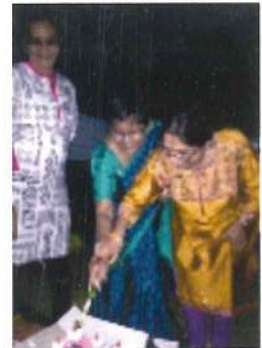
August birthday babies