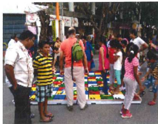
Events happening there