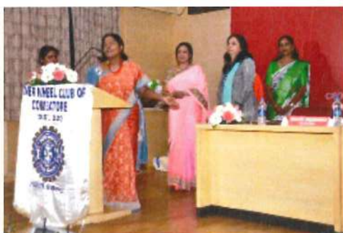
Induction of new members