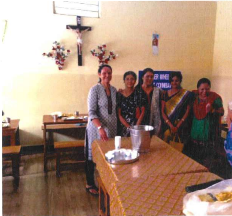
Members at Annadhanam

Annadhanam at Alvernia Old Age Home was done on 15th October. Soaps were distributed to the inmates on eve of the World HandWash Day