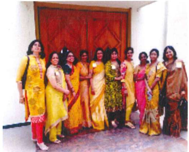
Our Members at the District Assembly