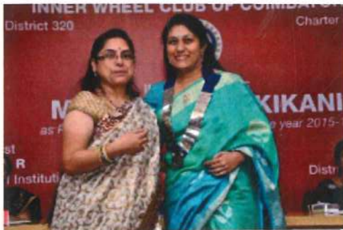
The Newly Installed President