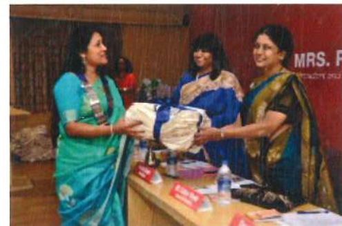
Kickstarting the "No Plastic