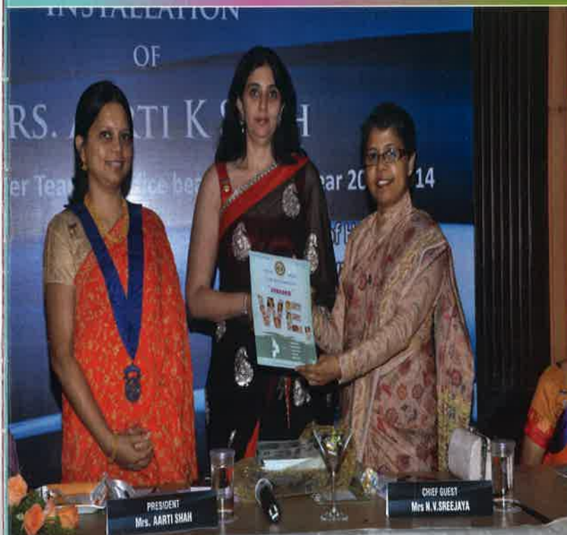
Release of Bulletin