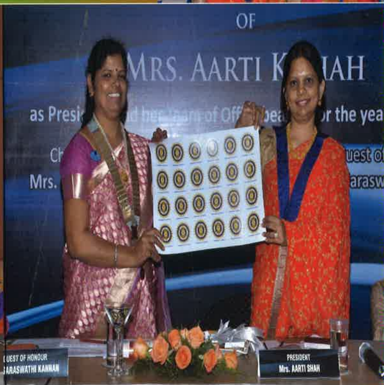
Release of Sticker