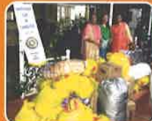
Kerala relief fund -66000 worth Items were donated