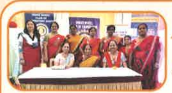
Joint Meeting with Mysore club