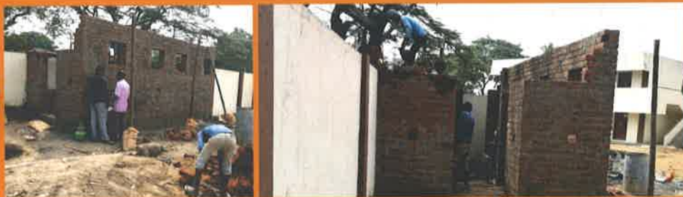
Toilets Building In Process In Singanalur Girls School