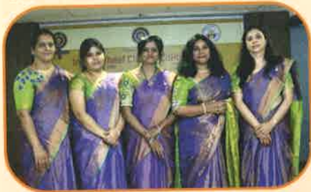
Glorious installation of our new 43rd president and her team