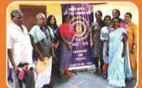
Donated 7000 for the education of leprosy children

Joint meeting with mysore club which gave us lot of insights of working systems of other clubs..