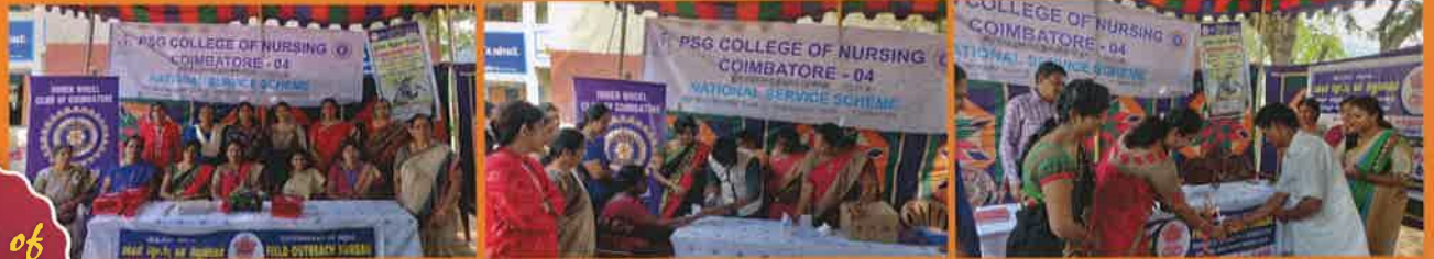
We set up a medical camp along with PSG college of nursing for anemic assessment and we donated HB Meter, 100 strips, 100 needles in Konganur Anaikatti Tribal Area.