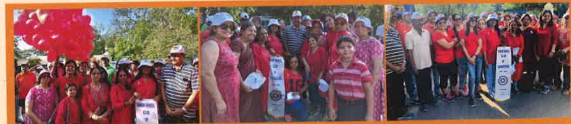
World Heart Day Was Celebrated By Organizing A Special Walkathon With Gknm Hospital.

THE "STRONGEST ACTIONS FOR A WOMAN" IS TO LOVE HERSELF, BE