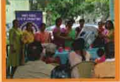
10 sets of pants and shirts to blind people.