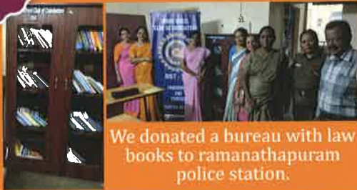
We donated a bureau with law books to ramanathapuram police station.